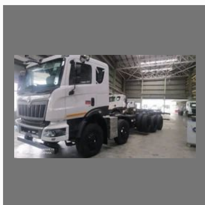
Blazo48 CBC - 16 Wheeler rigid Truck