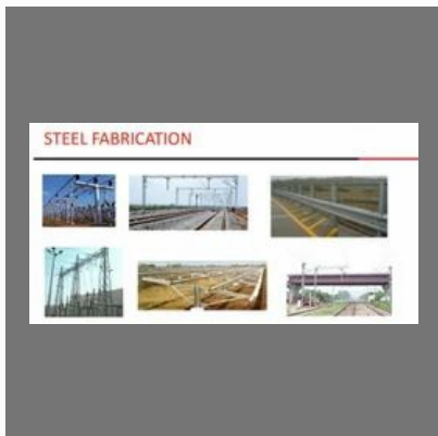
Steel Girder Bridge