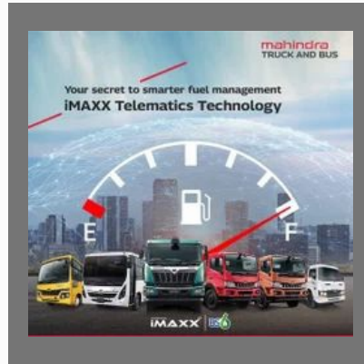
Mahindra Blazo 40 Tipper Truck