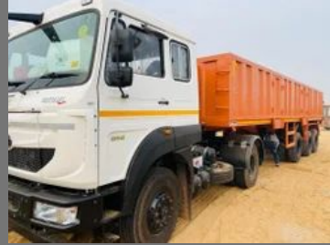
Side Wall Trailer