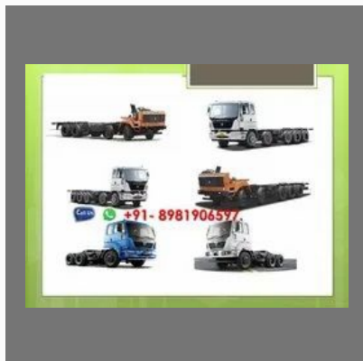
Ashok Leyland 16 Wheel Truck