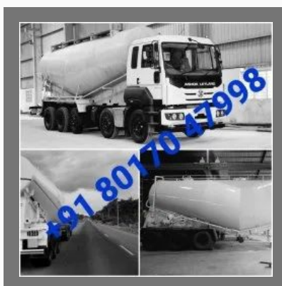
FLY ASH BULKER