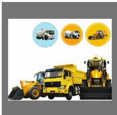
20 Feet Container Truck