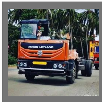
Commercial Vehicles, Trucks