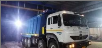
Medium & Heavy Commercial Vehicles