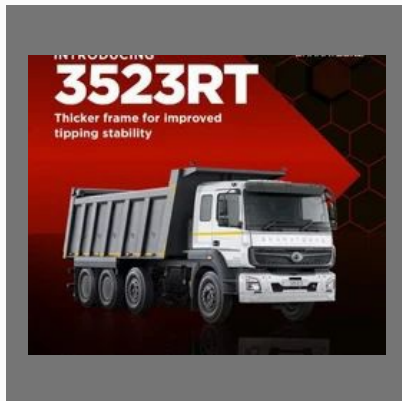
BharatBenz 16 Wheel 3523RT Truck