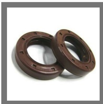
Viton Oil Seals