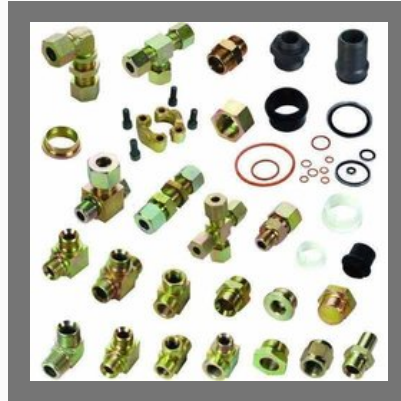
MS Hydraulic Fitting