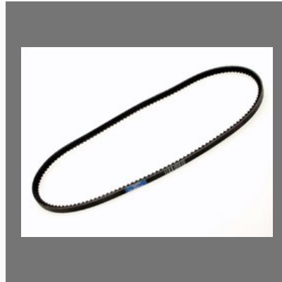
Fan Drives Timing Belt