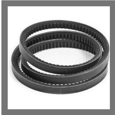
Open End V Belt