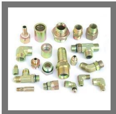
Mild steel (M.S.) Fittings