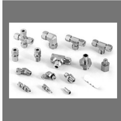
S.S Tube Fitting