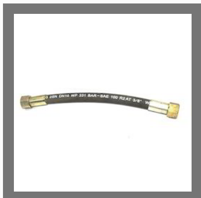
Hydraulic High Pressure Hose