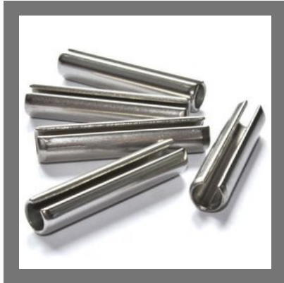
Circlips & Dowel Pins