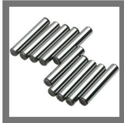
Metal Dowel Pins