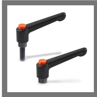
Elesa Garter Adjustable handles / Levers