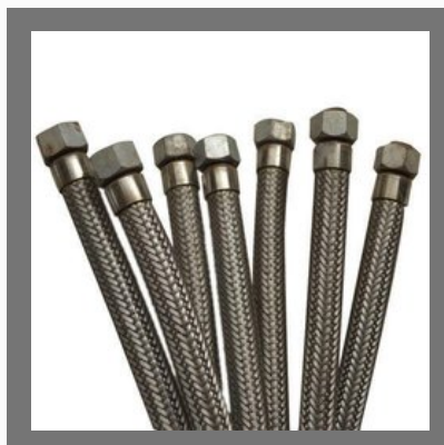
Hydraulic High Pressure Hose