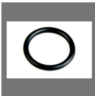
Viton O rings