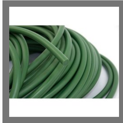
Polyurethane Round Section Belt