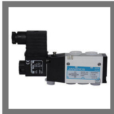
Janatic Solenoid Valve