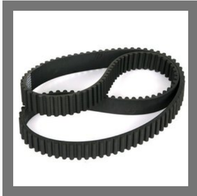
Rubber Timing Belt