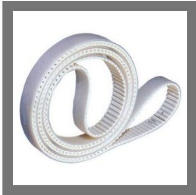
PU Timing Belt