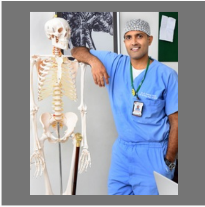
Rapid Recovery Joint Replacement Surgery Treatment