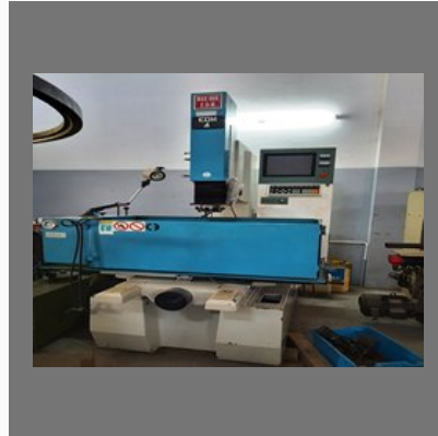
Max See P40 CNC EDM