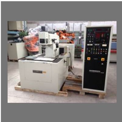
Used EDM machine - Hansen