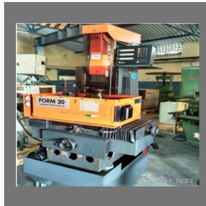
Used EDM Machine - Charmilles Form20