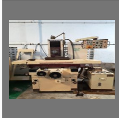
Chevalier Surface Grinder