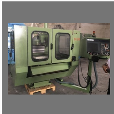
Used VMC - Mikron 31D