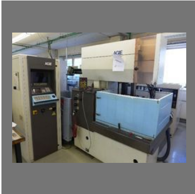
Used Wire EDM Machine - AGIE AGIECUT