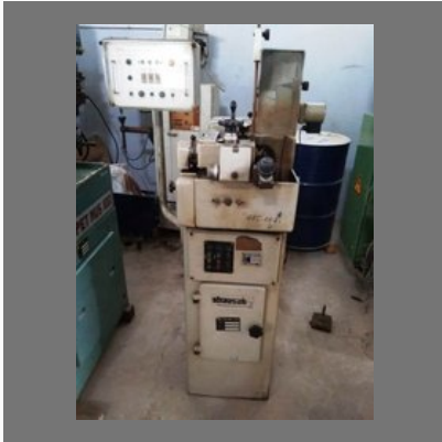
Strausak - Gear Cutting Machine