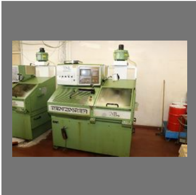
Used CNC Lathe - Benzinger TNL