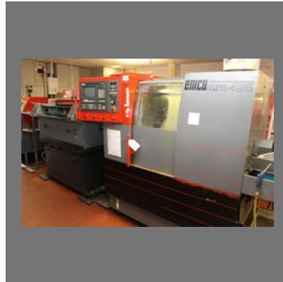
Used CNC Lathe - Emcoturn