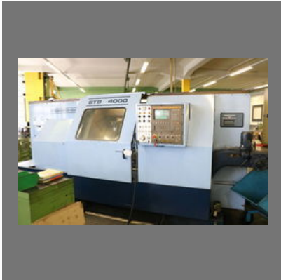
Used CNC Lathe - Storebro 4000