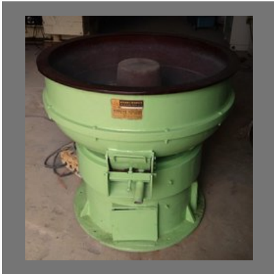
Vibro with separator - Song Sing Machinery