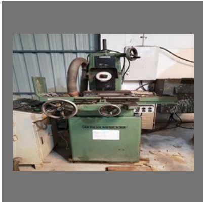
Okomotto Manual Surface Grinder