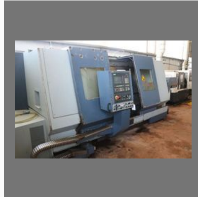
Used CNC Lathe - Padovani