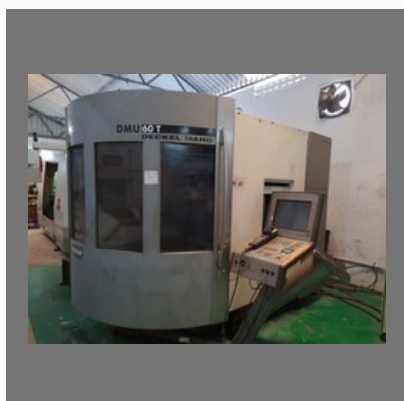
DECKEL MAHO DMU 60 T VMC