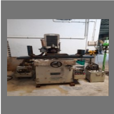
Kent Surface Grinder KGS 250 H