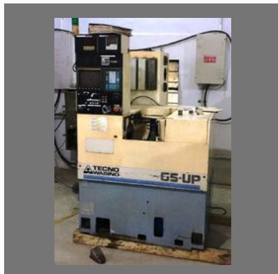
Techno Wasino G5 UP - Gang Type CNC Chucker