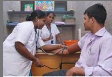
Intra Uterine Insemination (iui)