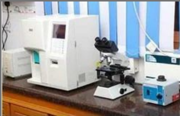
Preimplantation Genetic Screening