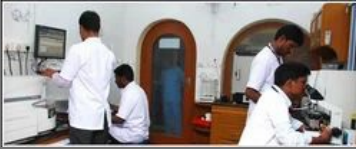
Tests and Diagnosis Services