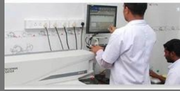
Luteal Phase Testing Services