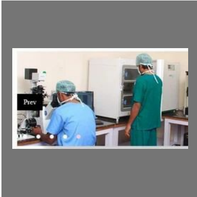
Testicular Biopsy Services