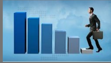
Business Insurance Service