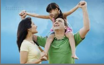
Life Insurance Service