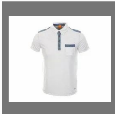
Polo Neck Collar T-Shirt