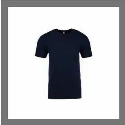
Navy Blue Round Neck T-Shirt