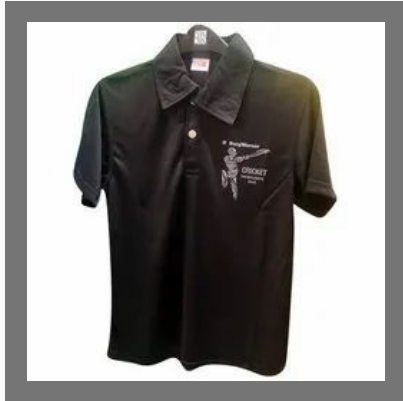
Sports Promotional T-Shirt