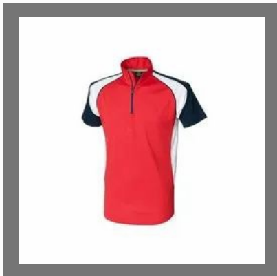
Mens Designer Sports T-Shirt