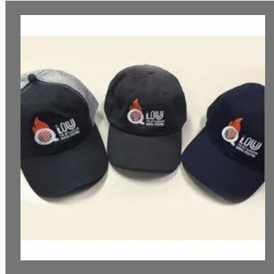
Polyester Promotional Cap