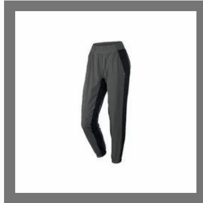
Mens Regular Track Pant