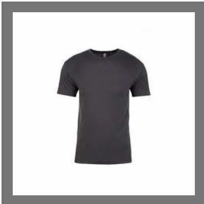
Charcoal Black Round Neck T-shirt