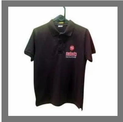
Corporate Promotional T-Shirt