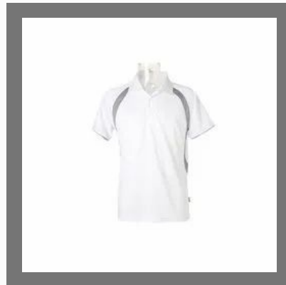
Mens White Sports T-Shirt