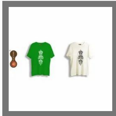
Round Neck T-Shirt