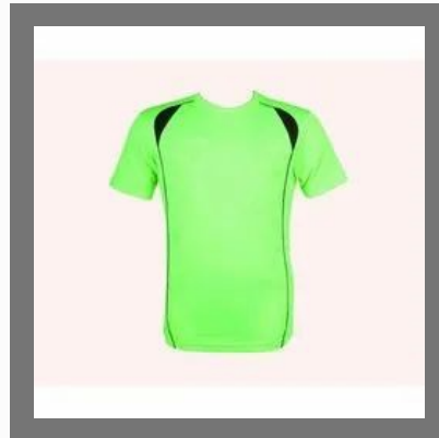
Mens Sports Round Neck T-Shirt