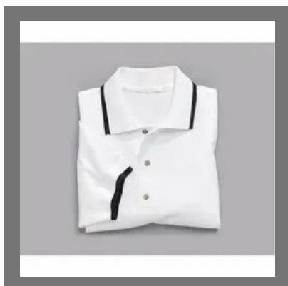
Collar Neck Polo T-Shirt