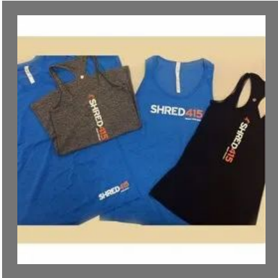
Mens Promotional Vest