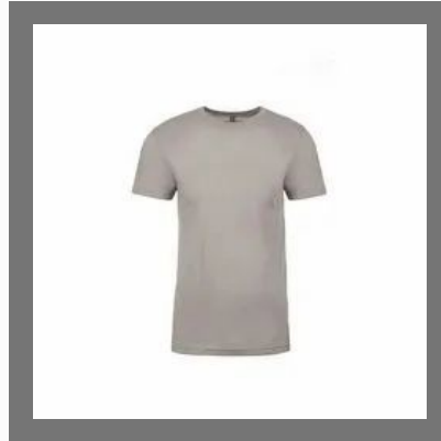
Grey Round Neck T-Shirt