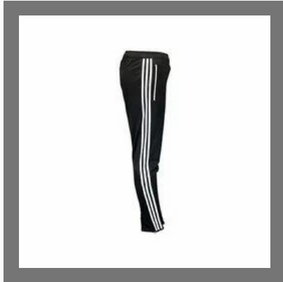
Mens Sports Track Pant