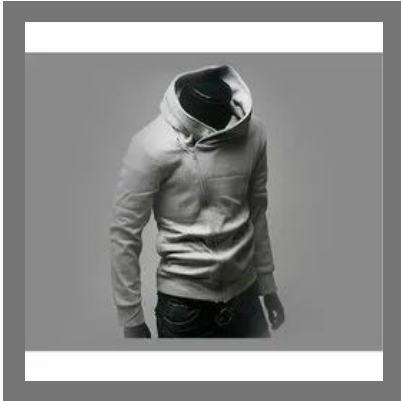
Trendy Mens Cotton Hoddie