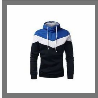
Full Sleeve Cotton Hoodie