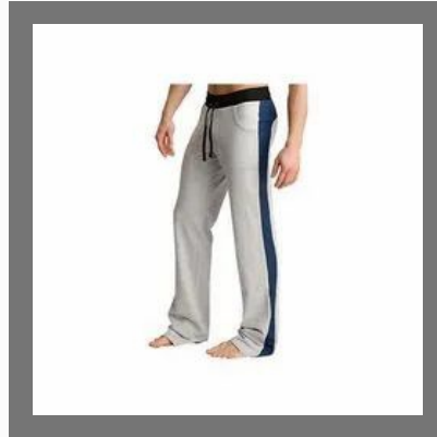
Mens Cotton Track Pant