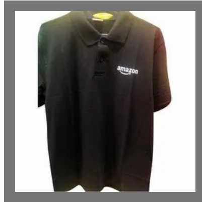
Corporate Printed Polo T-shirt