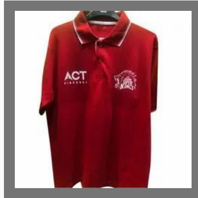
Red Promotional Polo T-Shirt