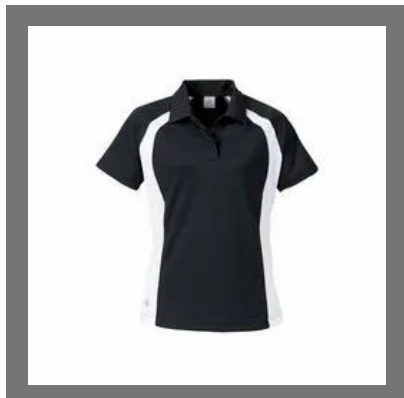
Polyester Polo Neck T-Shirt