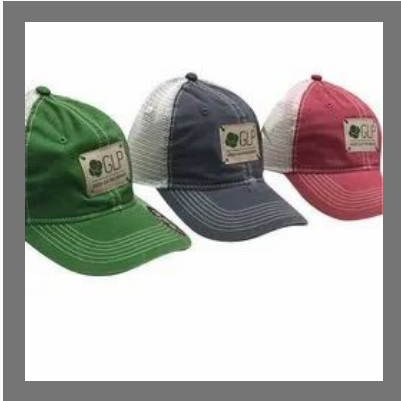
Corporate Gifting Cap