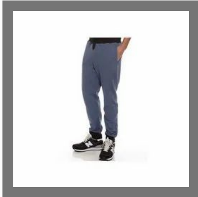
Mens Running Track Pant