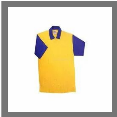
Mens Sports Collar Neck T-Shirt