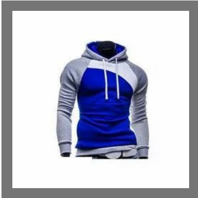
Mens Designer Cotton Hoodie