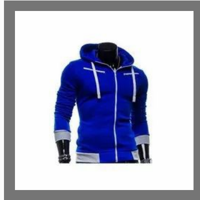
Mens Zip Cotton Hoddie