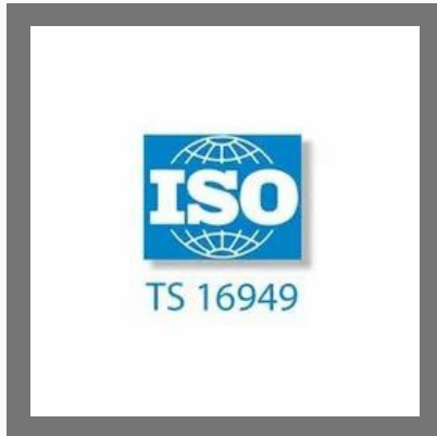
TS Notified Certification Services