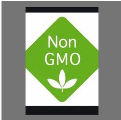
Non GMO Certification Services