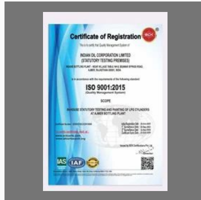
ISO 9001 2015 Certifications Services