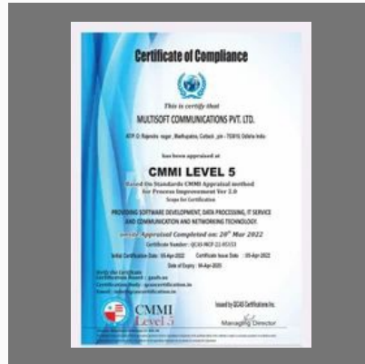
CMMI LEVEL 5 CERTIFICATIONS SERVICE