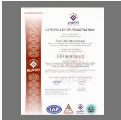
ISO 9001:2015 Certification services