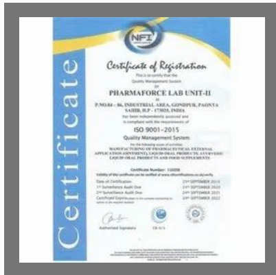
ISO 9001 2015 Certification Services