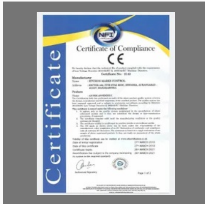
CE Marking Certification Services