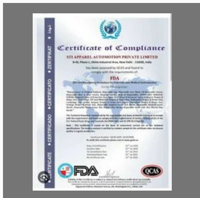
FDA Certification Services