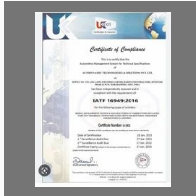
iatf 16949 certification