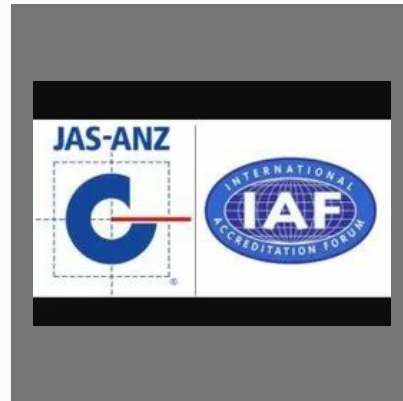
ISO 9001: 2015 Jasanz