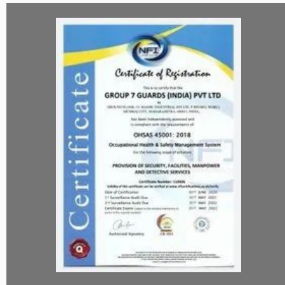
ISO 45001 2018 certification SERVICES