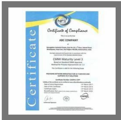
CMMI Certification Services