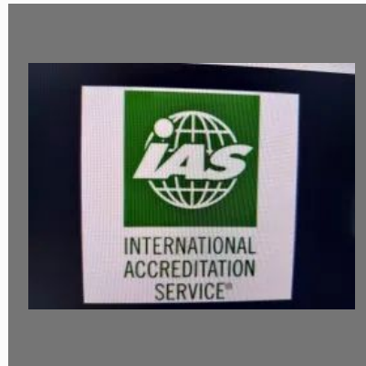
IAS CERTIFICATION SERVICES