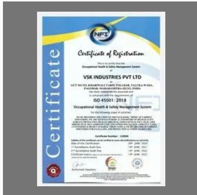
ISO Certification Consultancy