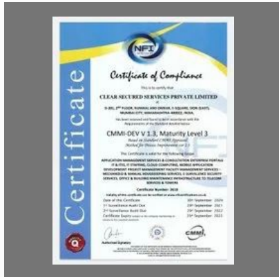
CMMI LEVEL 3 CERTIFICATIONS SERVICE