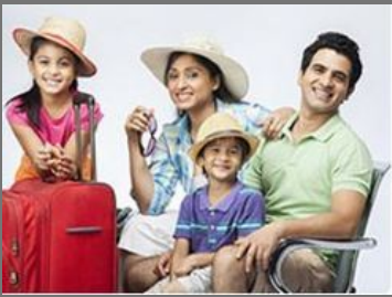
Travel Insurance Service