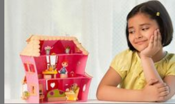
Building Insurance Service