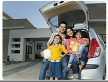
Motor Insurance Service