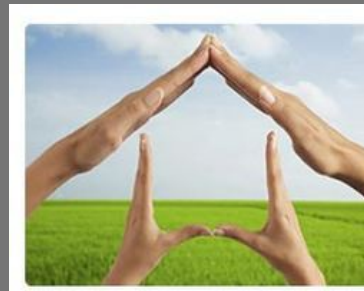
Home Insurance Service