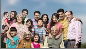
Family Good Health Insurance