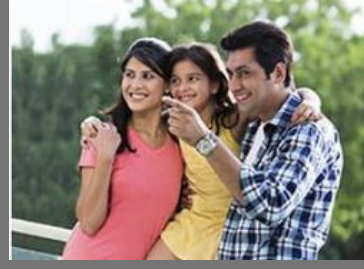
Health Insurance Service