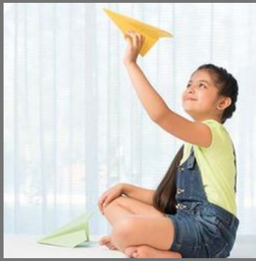
Air Freight Insurance Service