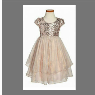
Ladies Western Wear