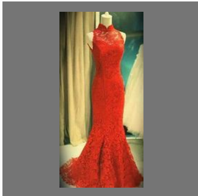
Designer Ladies Dress