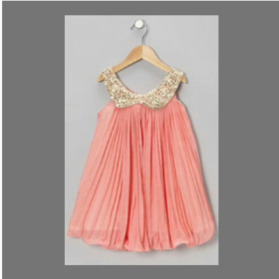
Ladies Western Top