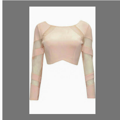
Ladies Western Blouses