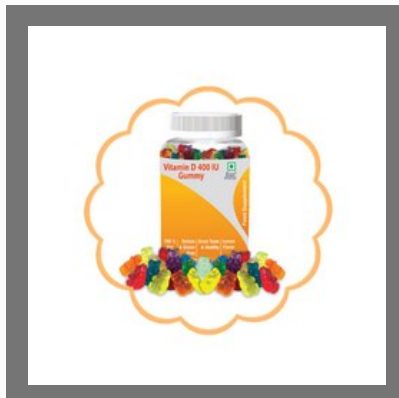
Vitamin D 400IU Gummy