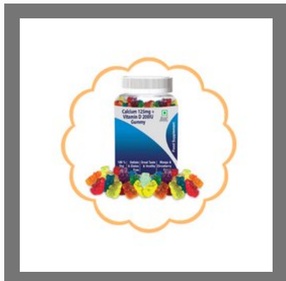
Calcium 125 mg plus Vitamin D 200 IU Gummy