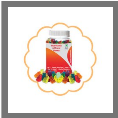
Multivitamin & Minerals Gummy