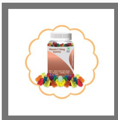
Vitamin C 30 mg Gummy