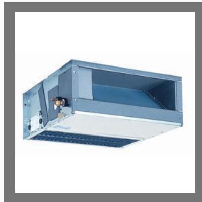
Mitsubishi Concealed Duct AC