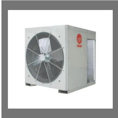
Trane Ductable AC