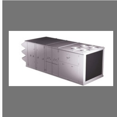
Rooftop HVAC Package Unit