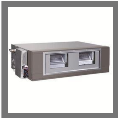
Mitsubishi Ductable AC