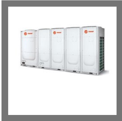
Trane VRF System