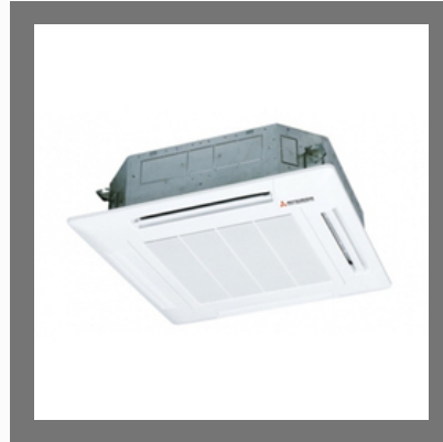
Mitsubishi Cassette AC with 1.5 Ton