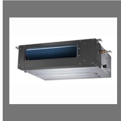
Midea Ductable AC