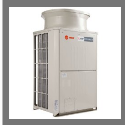
Mitsubishi VRF System