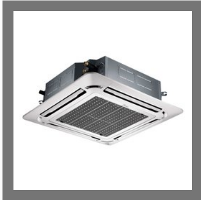
Midea Cassette AC