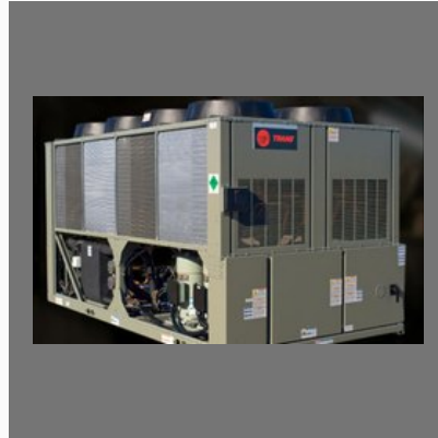
Trane Air Cooled Chiller