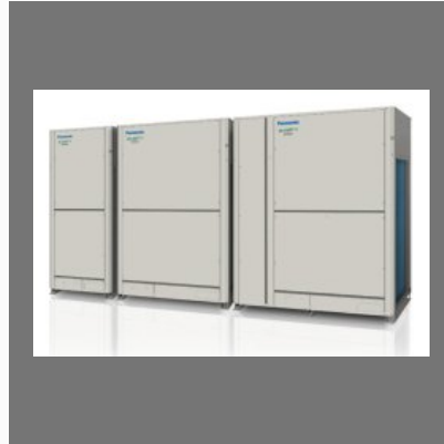
Panasonic VRF System