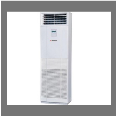
Mitsubishi Floor Standing Air Conditioner