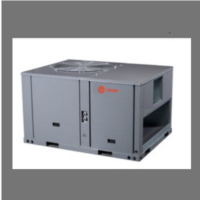
Trane Rooftop AC Package Unit