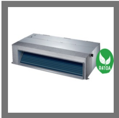
Trane Concealed Duct AC