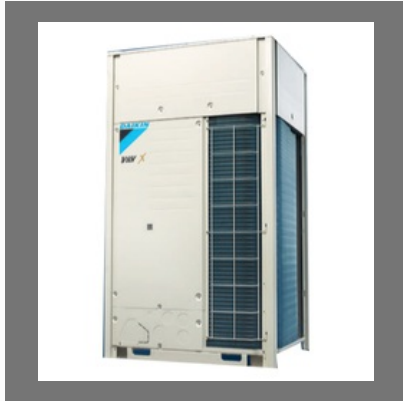
Daikin VRV Systems