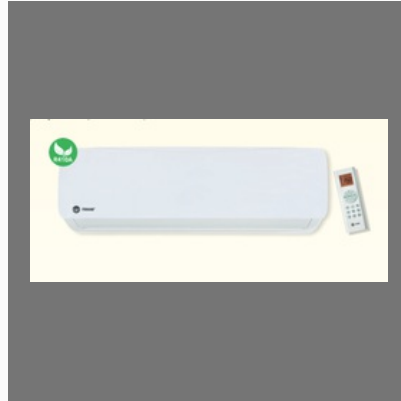
Trane Split AC