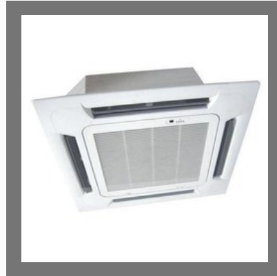
Panasonic Cassette AC