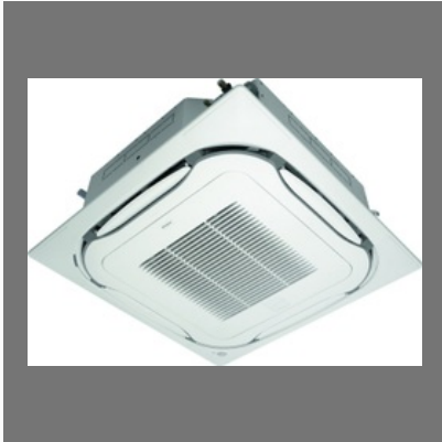
Daikin Cassette AC