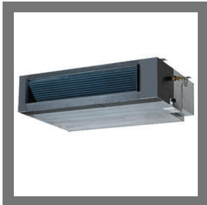
Midea Concealed Duct AC