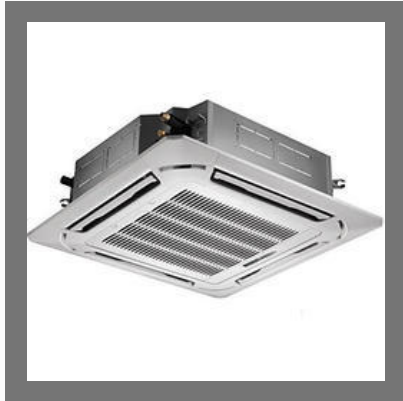
Trane Cassette AC