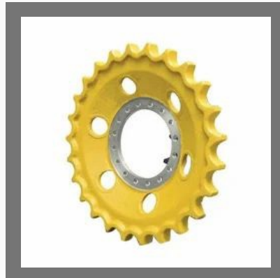
Under carriage Sprocket