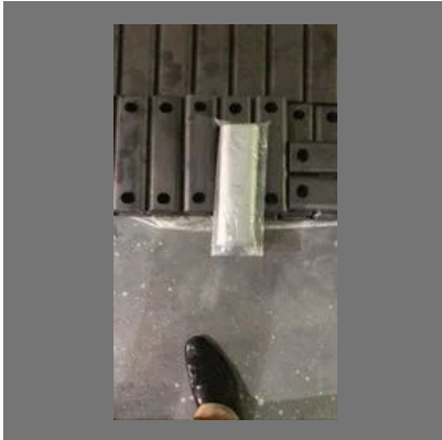
Hydraulic Breaker Tool Pin