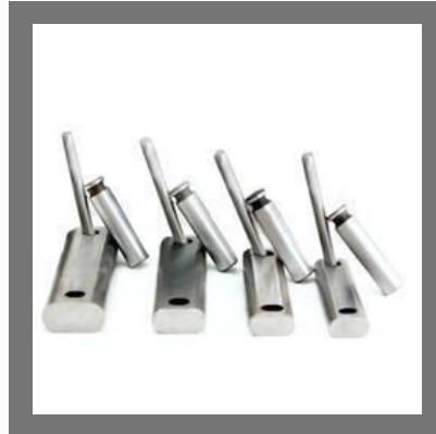
Hydraulic Breaker Rod Pins