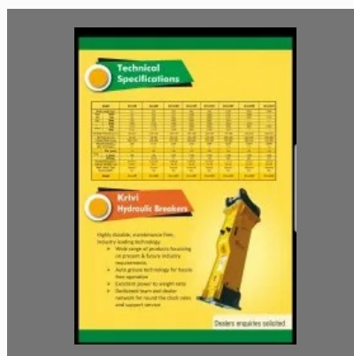
JCB Rock Breaker