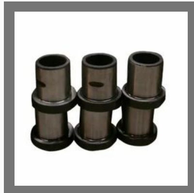
Front Cover Ring Bush