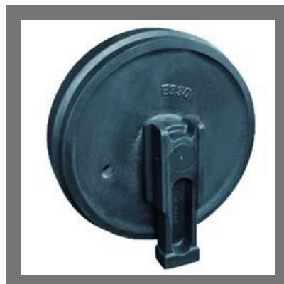
Under carriage Idler