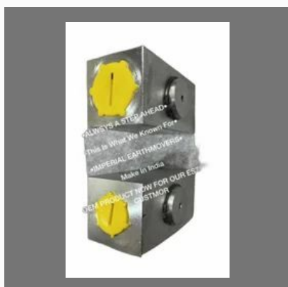
Rock Breaker Ball Valve