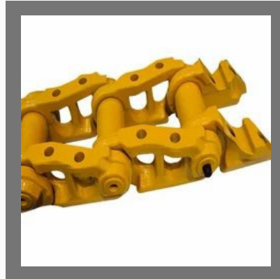
Undercarriage Loose Link