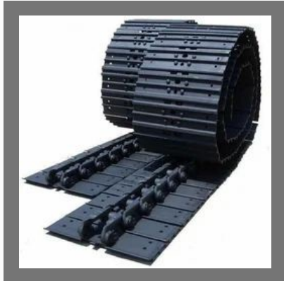
Undercarriage Track Shoe