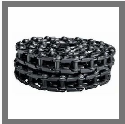
Undercarriage Link Assembly