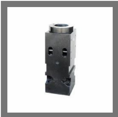
Hydraulic Breaker Front Head