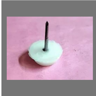
Plastic Pin Buffer End Cap