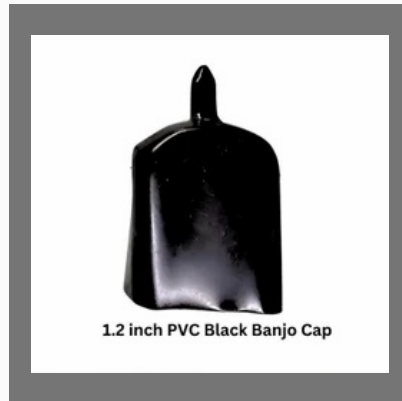
1.2 Inch PVC Black Banjo Cap