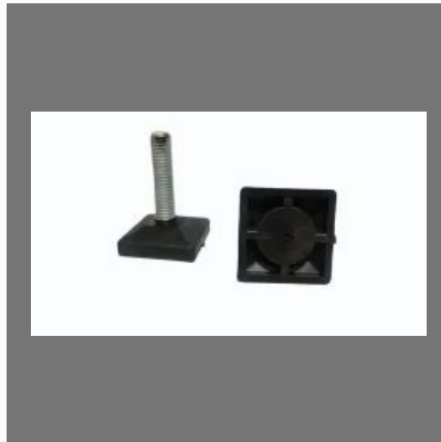
Levelor Square, OD_35mm, Thread-39 for furniture