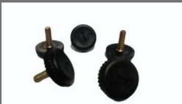
Levelor-8x20,OD-25 for furniture