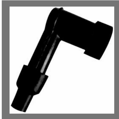
Black Plastic Spark Plug Cap