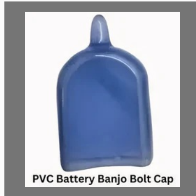
PVC Battery Banjo Bolt Cap