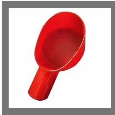
PVC Battery Terminal Cap