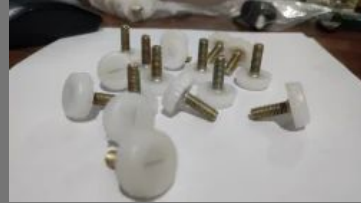
Levelor-6x20,OD-20 for furniture