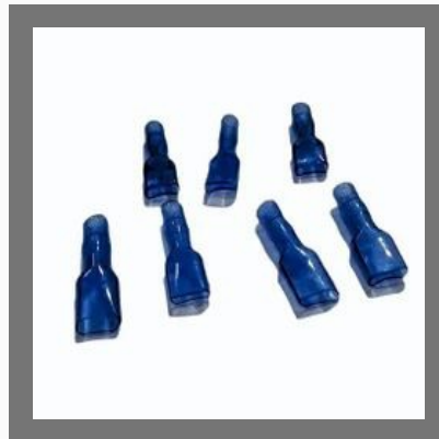
4mm PVC Dip Moulding Cap