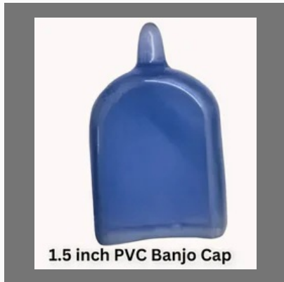
1.5 Inch PVC Banjo Cap