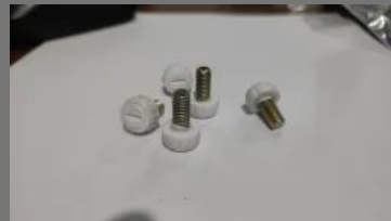
Levelor-6x15,OD-12mm,Thread-12mm for furniture