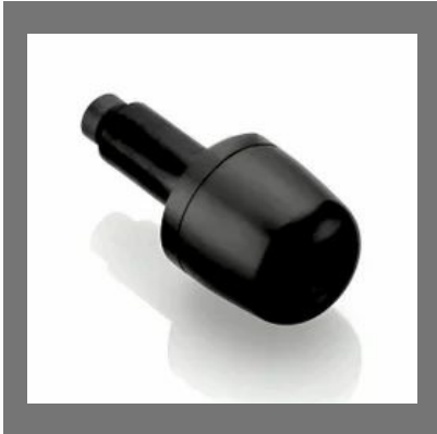
Bike Plastic Handle Cap