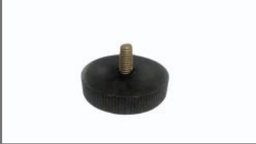
Levelor-8x12,OD-47.50,Thickness-11mm for furniture