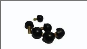
Boul Buffer, OD-14.11,Thread-12.50 for furniture