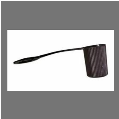
Nylon Car AC Charging Port Cap