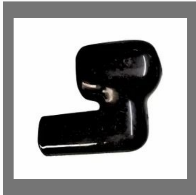
Dip Moulding PVC Battery Thimble Cap