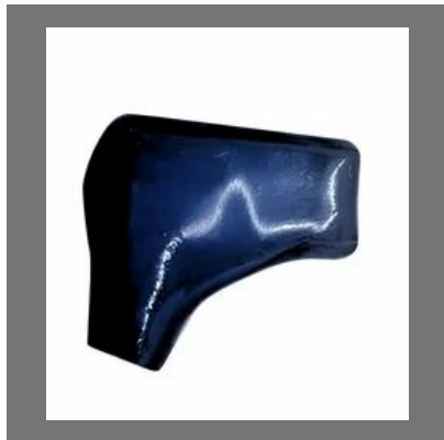
Dip Moulding PVC Wiring Cap