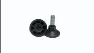
Levelors For Furnitures