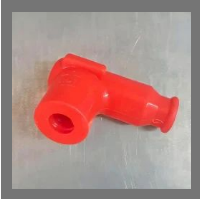
Red Plastic Spark Plug Cap