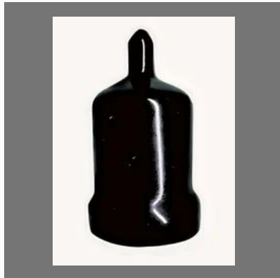
20mm PVC Dip Moulding Banjo Cap