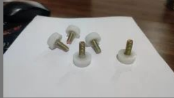
Levelor-8x20,OD-23mm for furniture