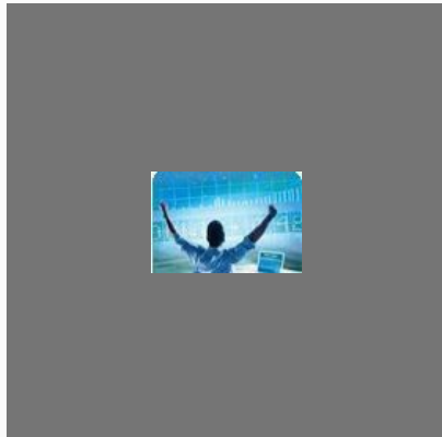
F And Q Services