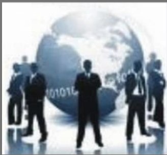
NRI Investments Service