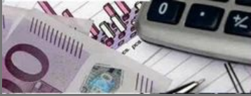
Depository Participant Services