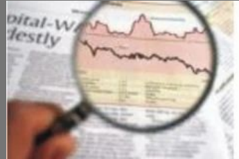
E Broking Internet Trading