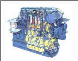
Marine Diesel Engine