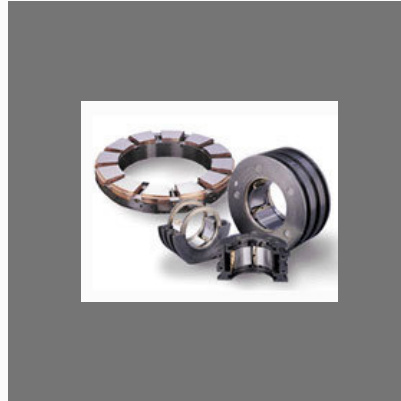
Turbine Journal & Thrust Bearings