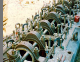
Line Boring In Site-2