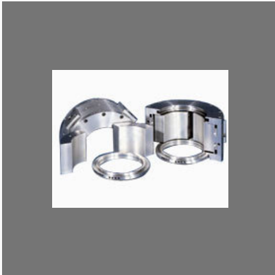
Tilting Pad Bearings