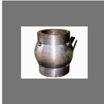
Self Aligning Spherical Bearings