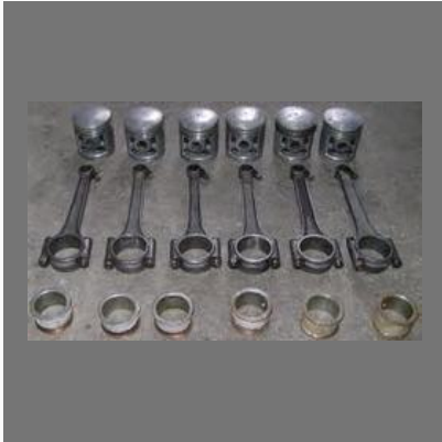
Big End Bearing