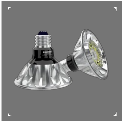
LED Light Bulb