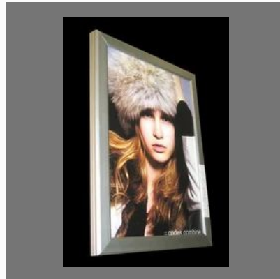
LED Light Box