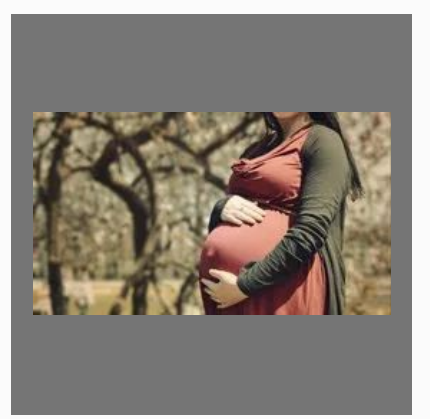
Surrogate Mother All Over India