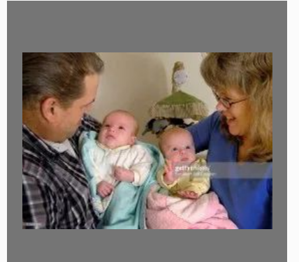
Egg Donor Treatment