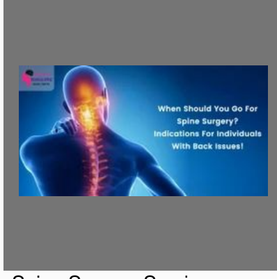
Spine Surgery Service