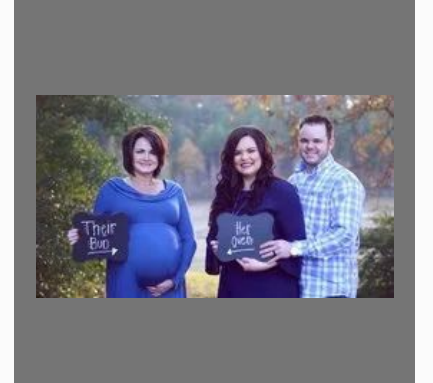
Clinic Ivf Infertility