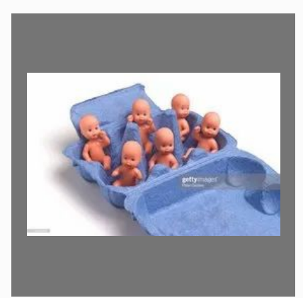
Egg Donor India