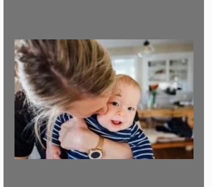
Surrogacy Treatment Services