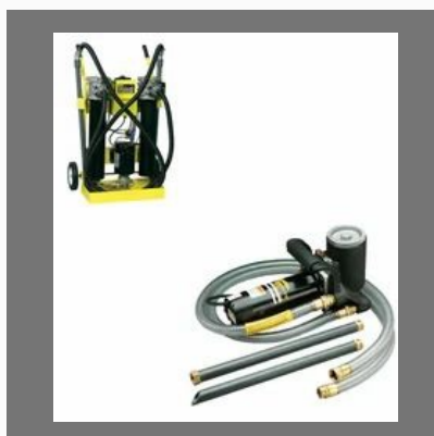
Guardian Portable Filtration System