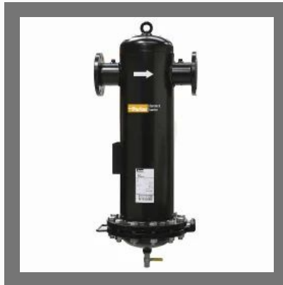
Carbon Steel Fabricated Compressed Air Filters