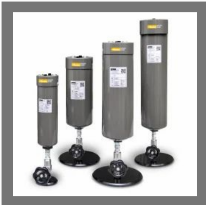
Parker High Pressure Compressed Air Filters