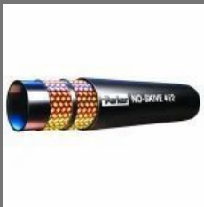
Parkrimp Medium Pressure Hose