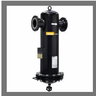
Parker Flanged Filters