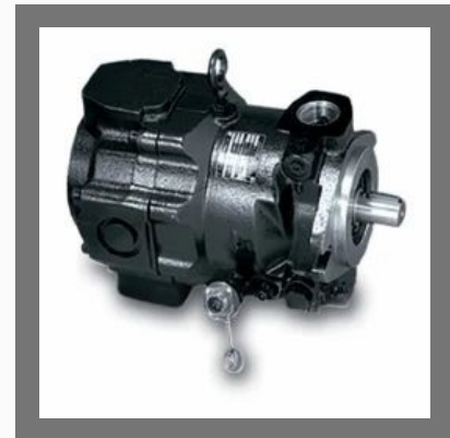
PARKER Medium Pressure Super Charged Piston Pump