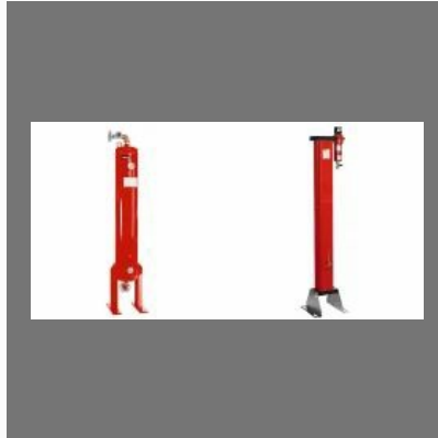
Activated Carbon Adsorbers