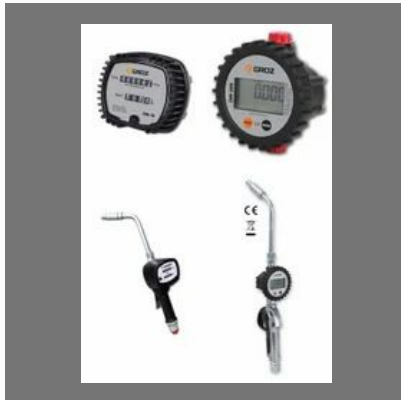
Oil Meters & Guns