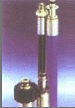
Parclean High Pressure Hose