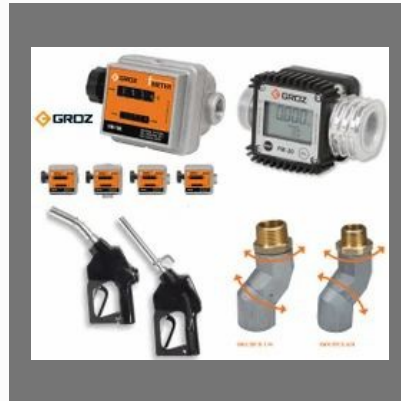
Fuel Meters & Nozzles