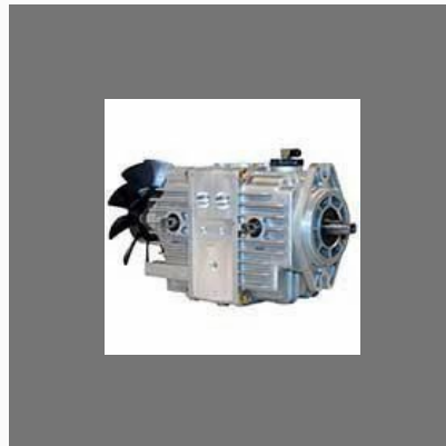
PARKER Tandem Integrated Hydrostatic Piston Pump