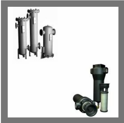
Compressed Air & Gas Filters