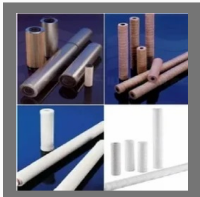
Process Wound Filters