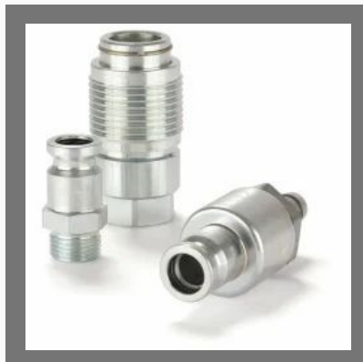
High Pressure Quick Coupling