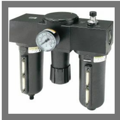
Hi-Flow Modular 2-Unit Mist FRL Combo - P3NCA Series