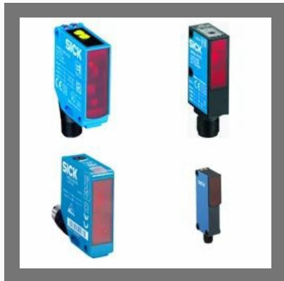
Small Photoelectric Sensor