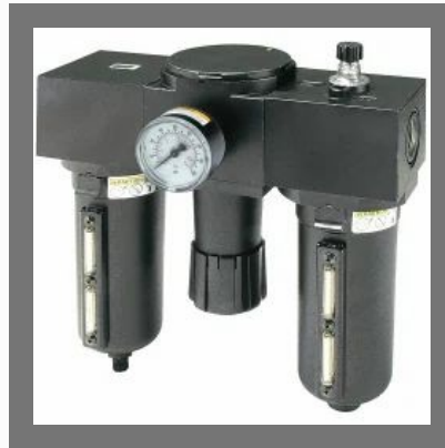
Hi-Flow Modular 3-Unit Mist FRL Combo - P3NCB Series