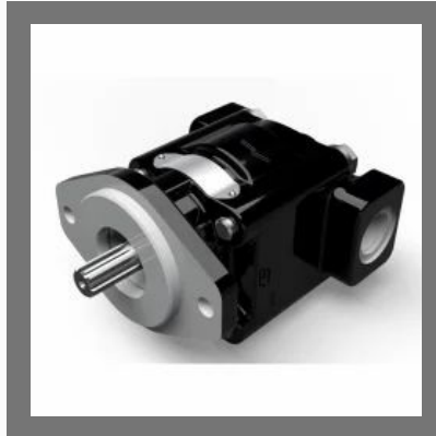
Cast Iron Bushing Pumps - Model 330