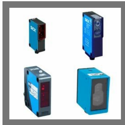
Compact Photoelectric Sensors