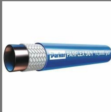
Ultra High Pressure Thermoplastic Hose