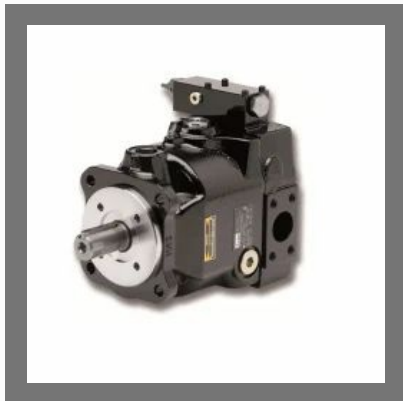
PARKER High Pressure Industrial Piston Pump