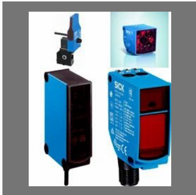
Multitask Photoelectric Sensors