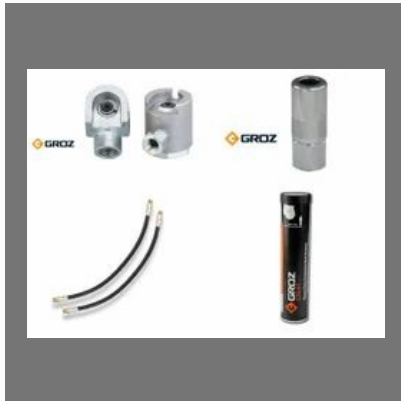
Grease Gun Accessories