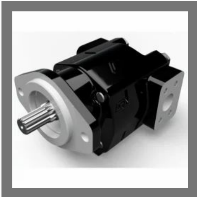
Cast Iron Bushing Pumps - Model 350