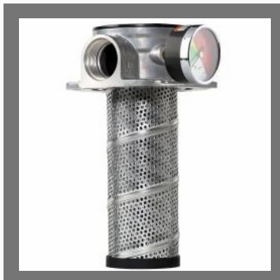
Tank Top Filters