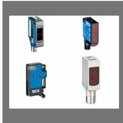
Miniature Photoelectric Sensors