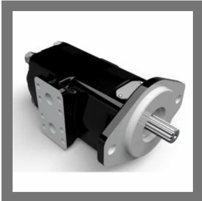
Cast Iron Bushing Pumps - Model 315