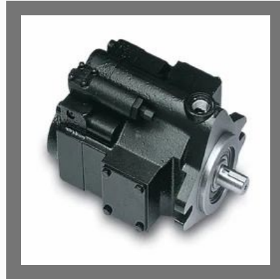
PARKER PVP Medium Pressure Piston Pump