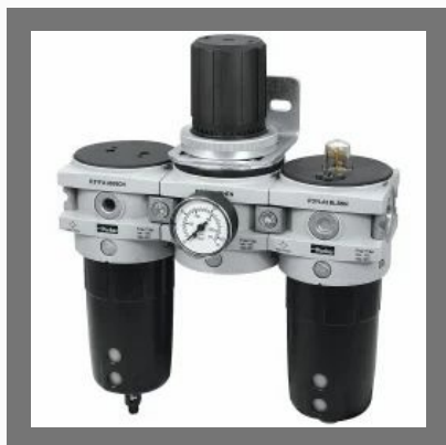
Global Hi-Flow Modular FRL Combo - P3YCA Series