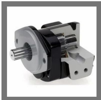
Cast Iron High Pressure Pumps - Model 610