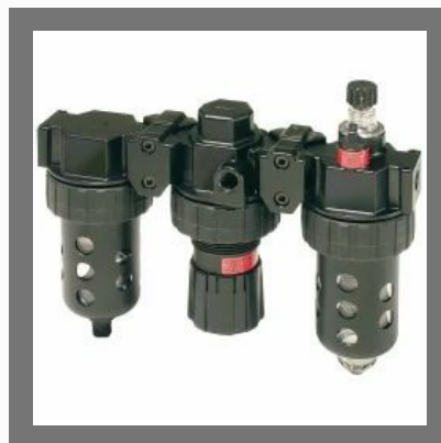
Compact Modular 3-Unit Mist FRL Combo - 06B Series