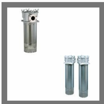
Multi Flow Tank Mounted Filters