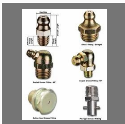
Grease Fittings & Accessories