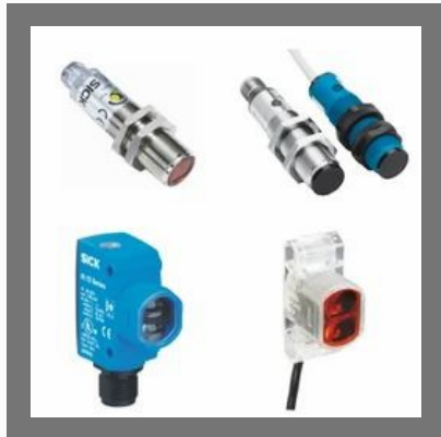
Cylindrical Photoelectric Sensors