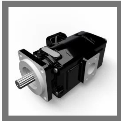
Cast Iron Bushing Pumps - Model 365