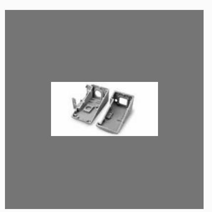
Defense Components, Ferrous Castings, Non Ferrous Castings