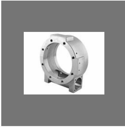
Gear Box Housing