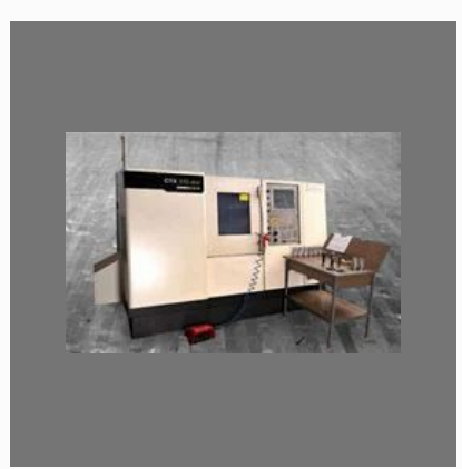
CNC Turn Mill