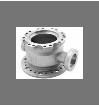
Ball Valve Body