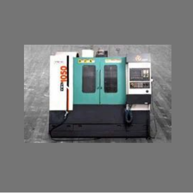
CNC Vertical Milling Centers