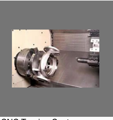
CNC Turning Centers