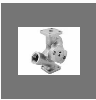
Steam Trap Station Body