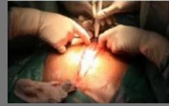
Open Chest Surgery