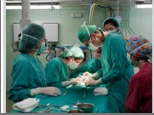
Vats (Key-Hole) Surgery