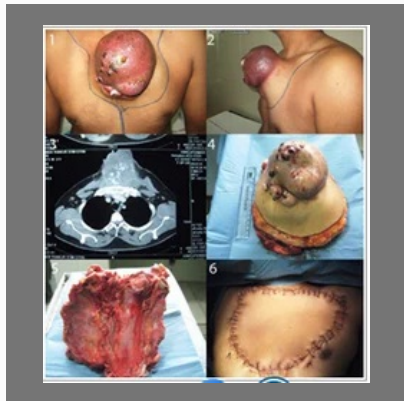
Chest Wall Tumours