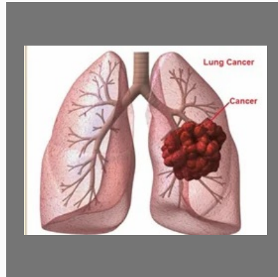
Lung Cancer Treatment Program