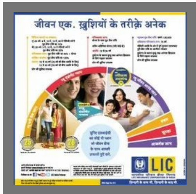
Lic Insurance Advisors