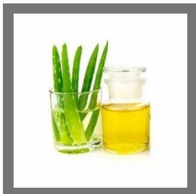
Green Aloe Vera