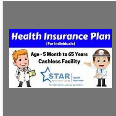
Star Health Insurance Services