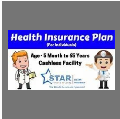
Insurance Agent Star Health