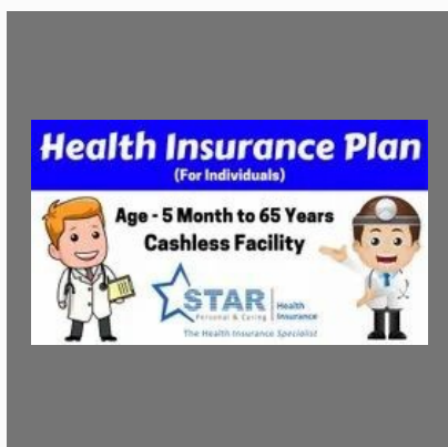
Star Health And Allied Insurance Company Limited