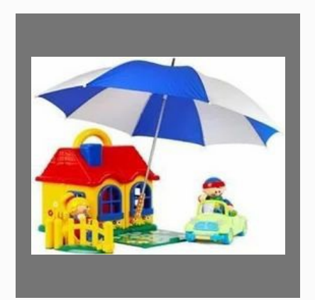
General Insurance Service