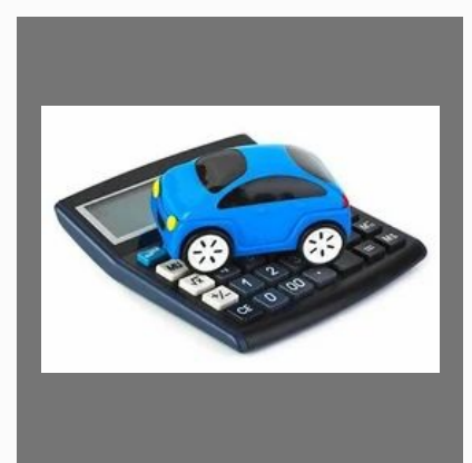
Car Finance Service