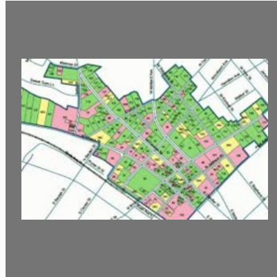
GIS Survey Analysis