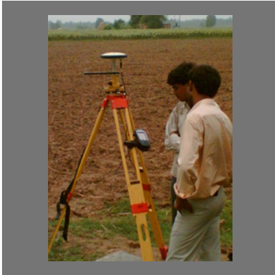
Land Survey Services