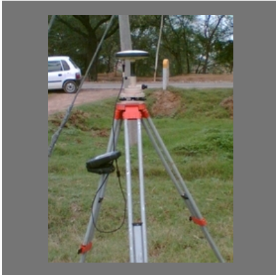
DGPS control points fixing