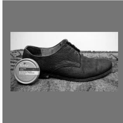
Black Leather Shoes