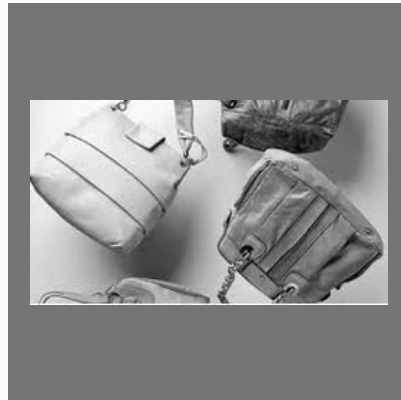
Ladies Designer Hand Bag