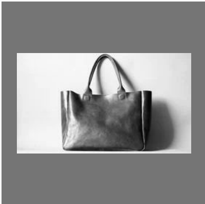
Ladies Leather Hand Bag