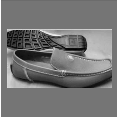
Men Casual Shoes