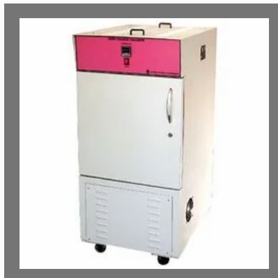
Digital Zero Degree Chamber