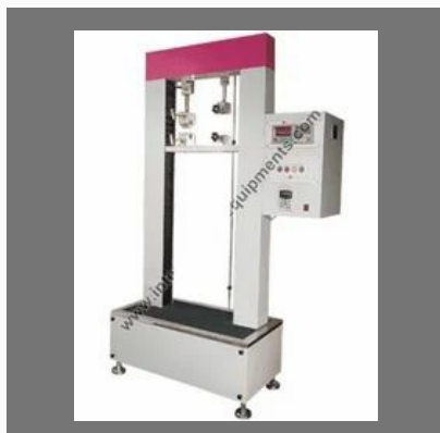
Material Testing Equipment