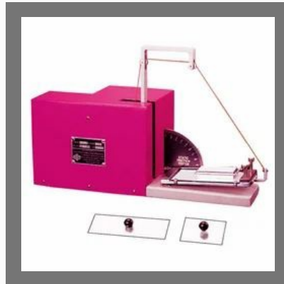
Inclined Plane Tester