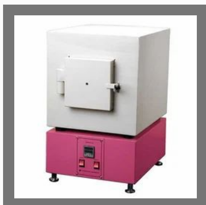
Digital Muffle Furnace