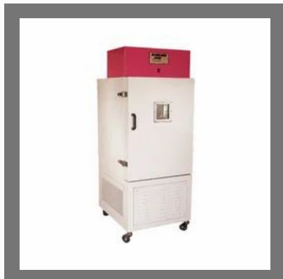
Computerised Humidity Chamber