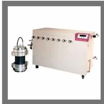
Hydrostatic Pressure Testing Equipment