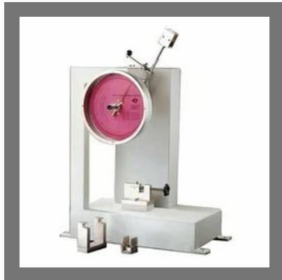
Izod Impact Tester