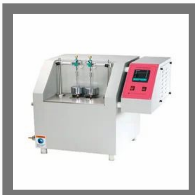
Computerized VSP/ HDT Apparatus