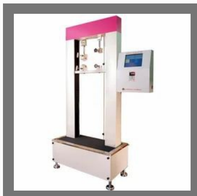
Universal Testing Machine