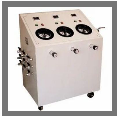
Analogue Hydrostatic Pressure Testing Equipment