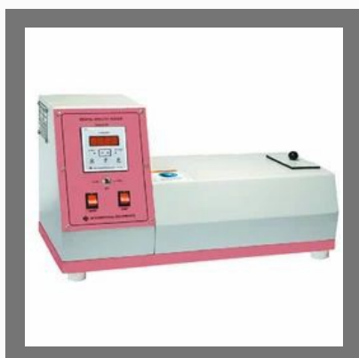
Digital Opacity Tester