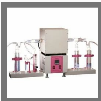
Carbon Black Content Apparatus