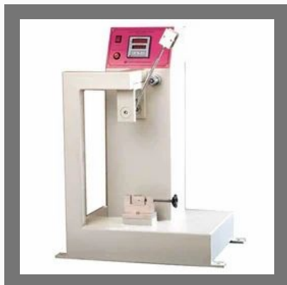
Charpy Impact Tester