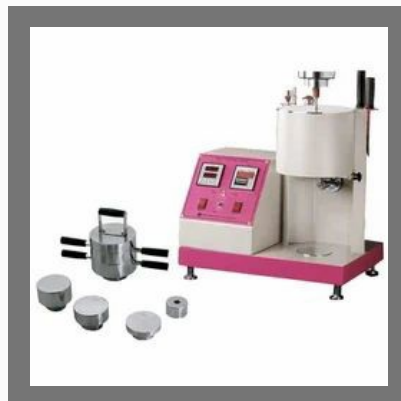
Melt Flow Index Tester