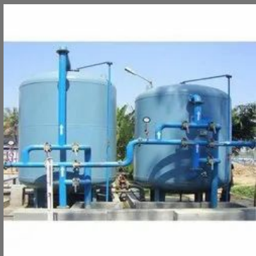
Activated Carbon Filters