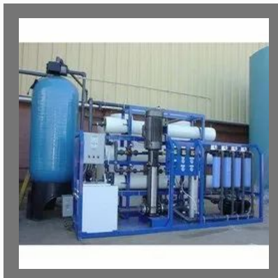
Reverse Osmosis Plants