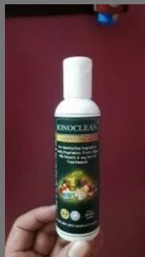
Vegetables Fruits Cleaner