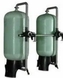
Pressure Sand Filters