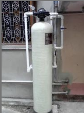
Domestic Iron Removal Filters