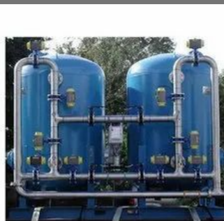
Water Demineralisation Plant