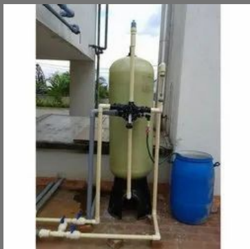
Water Softening Plant