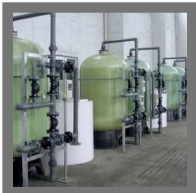
Industrial Demineralization Plant