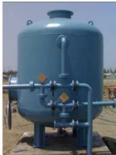
Industrial Iron Removal Filters