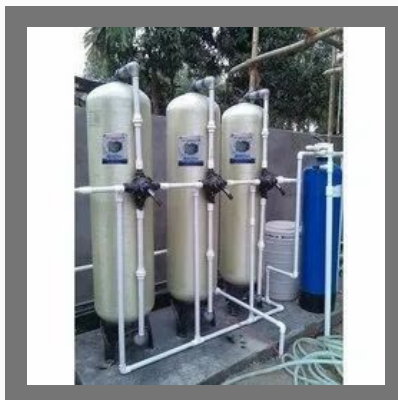
Arsenic Removal Filter Plant