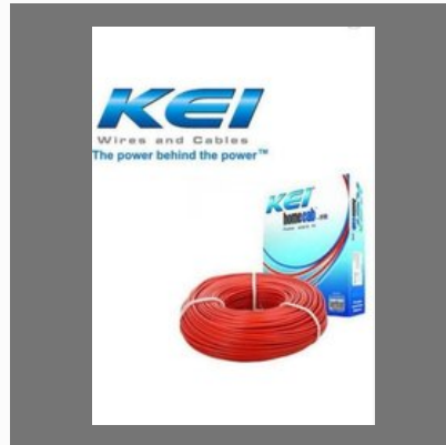
Kei House Wire - Fr 1.0 Sq mm Single Core Copper PVC Insulated Wire