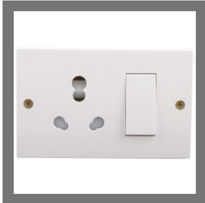
Anchor Penta Modular Switch