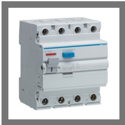
Hager 40A Four Pole RCCB