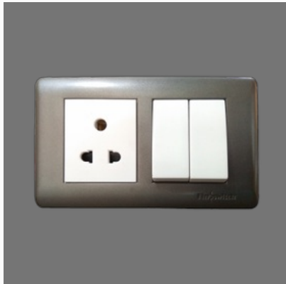
220 V Electric Switch