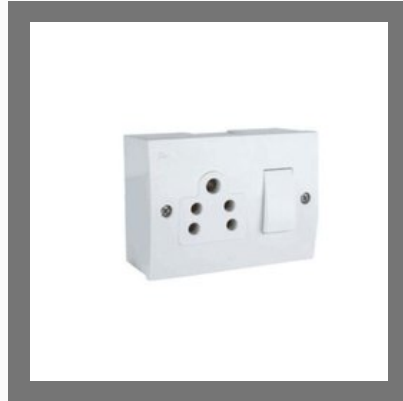
White Electrical Switch