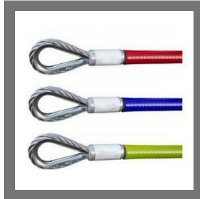
Colored Electric Wire