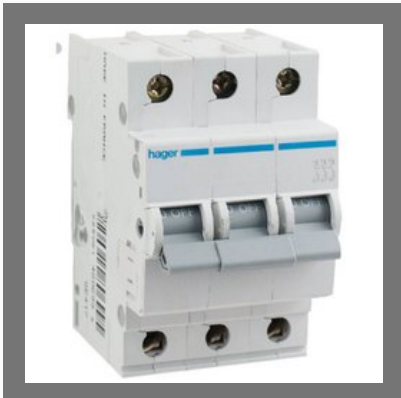
Hager 32A Triple Pole MCB