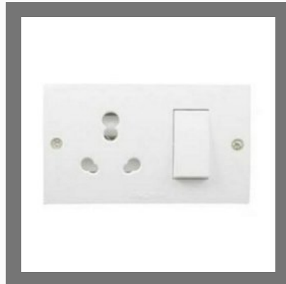
Anchor Electrical Switch