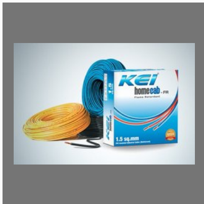
180 Meter KEI House Wire & Cable