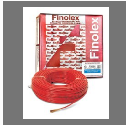
Finolex 2.5-Sqmm FR PVC Insulated Cable