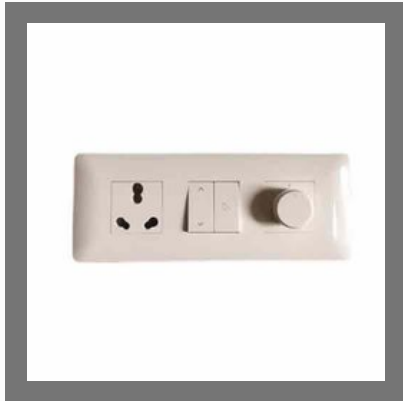
3 Pin Socket Plastic North West Venia Switch