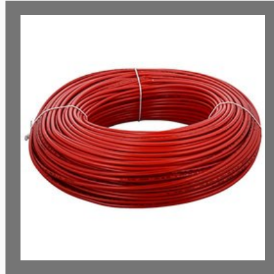
Finolex 2.5 Mm 90 Mtr Fr House Wire