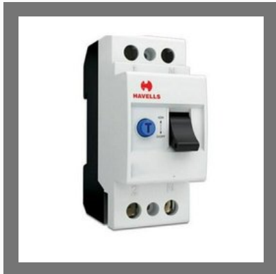
40 A Hager RCCB