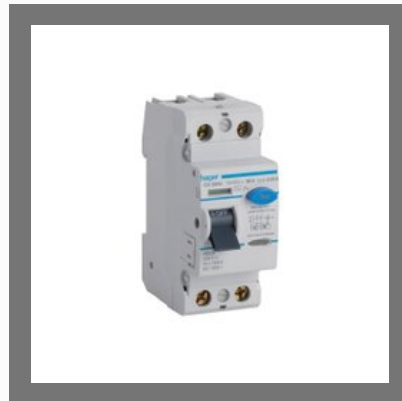
Hager 25A Double Pole RCCB