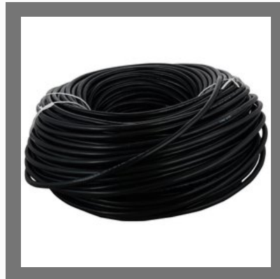
Black Electric Wire