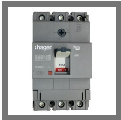
Hager 63A Triple Pole MCCB