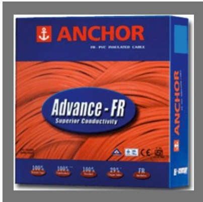
FR PVC Insulated Wire