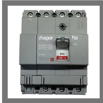
Hager 100A Four Pole MCCB