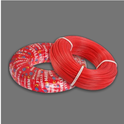
Havells Copper Wire