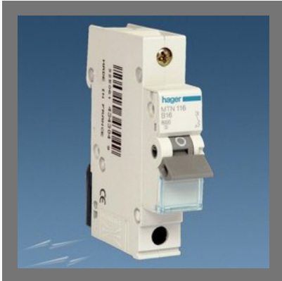
Hager 16A Single Pole MCB