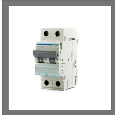
Hager 32A Double Pole MCB