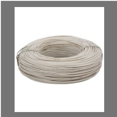
Anchor House Wire