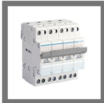
Hager 63A Four Pole MCB