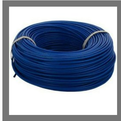
Electric Housing Wire