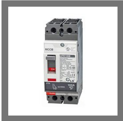
Hager 32A Double Pole MCCB