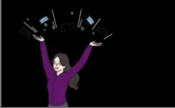
Covid Anti Body Package