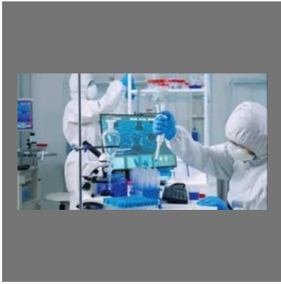
Iris Advanced Molecular lab