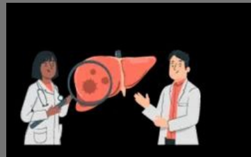
Liver Health Package For Alcoholics