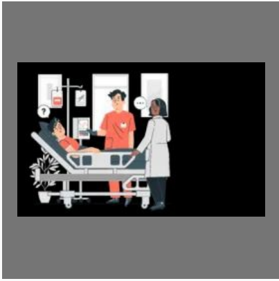
Master Health Check-Up