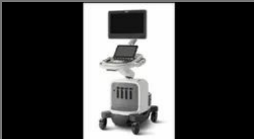
Ultrasound Imaging System