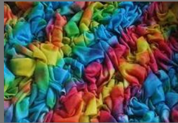
Fabric Dyeing Services