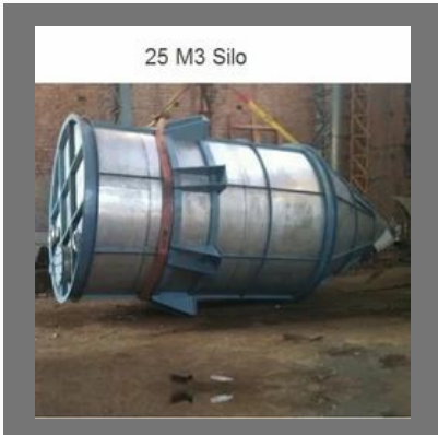
25 M3 Silo Storage Tank