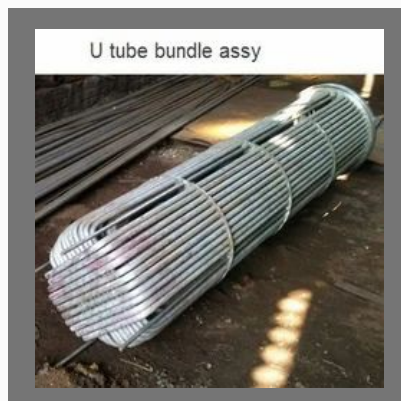
U Tube Bundle Assy