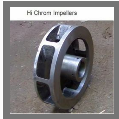
Hi Chrom Impeller