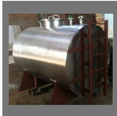
Stainless Steel Electro Polished Tank