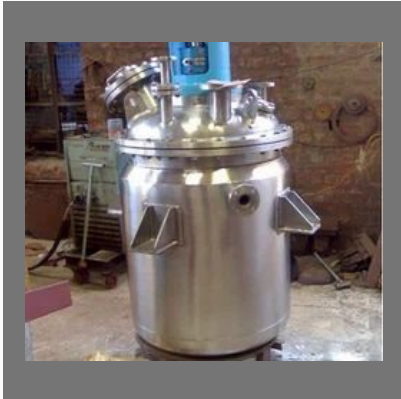
Jaketed Reaction Vessel