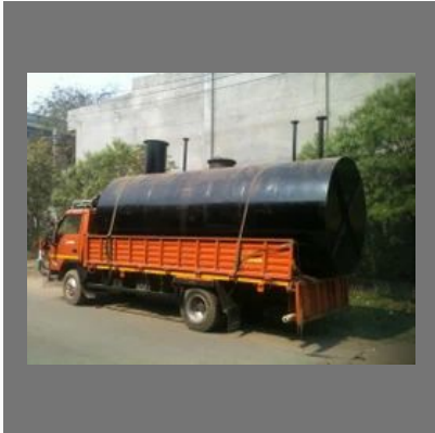
Storage And Process Tank