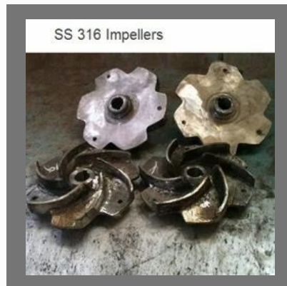
SS 316 Impeller