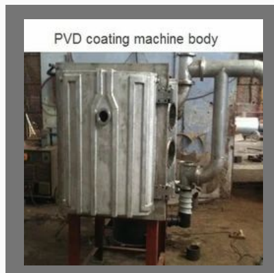
PVD Coating Machine Body