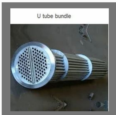
U Tube Bundle