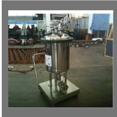
Teflon Coated Pressure Filter (GMP Model)