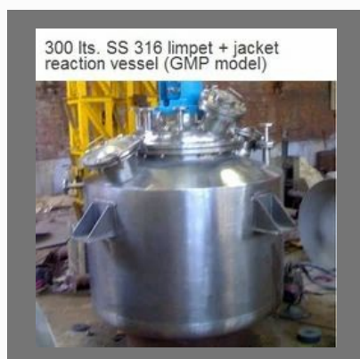
25 M2 Reaction Vessel