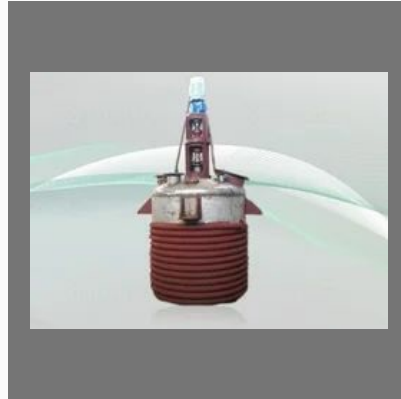
Reaction Vessel Tank