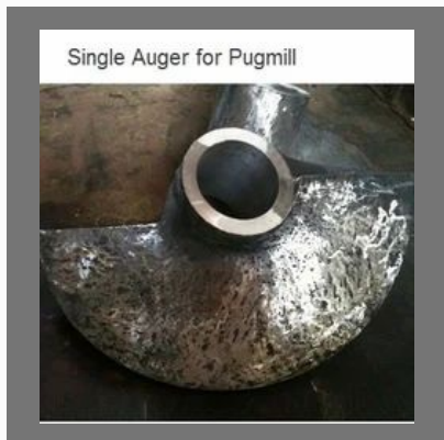
Single Auger For Pugmill