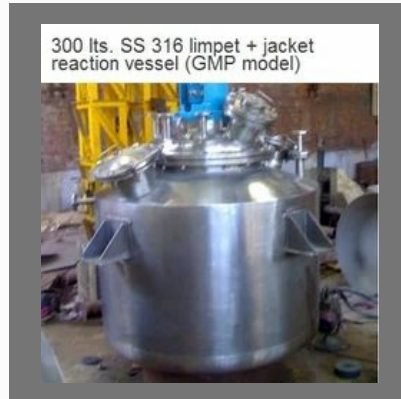
Limpet And Jaketed Reaction Vessel