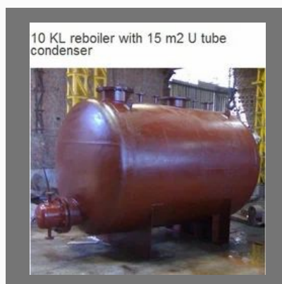
10 KL Reboiler With 15 M2 U Tube Condenser