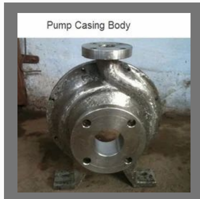
Pump Casing Body