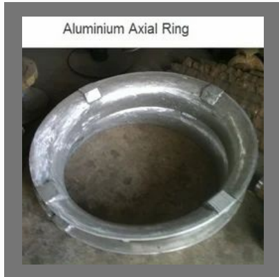
Aluminium Axial Ring