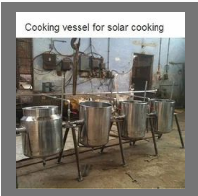
Cooking Vessel For Solar Cooking