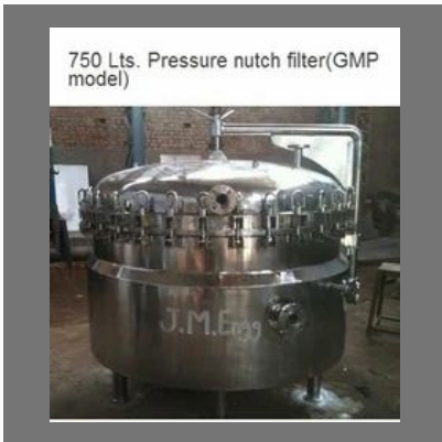
750 Lts Pressure Nutch Filter (GMP Model)