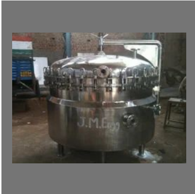
Pressure Nutsche Filter