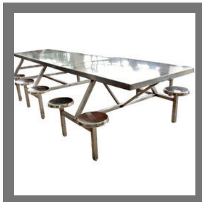
Hostel Dining Table