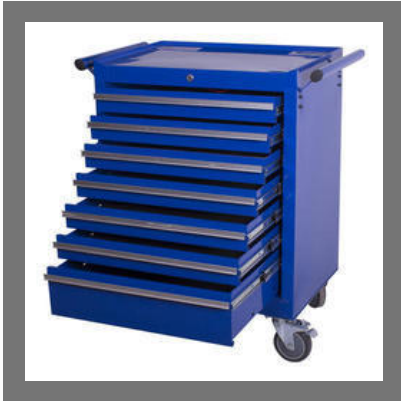
Lockable Tool Trolley