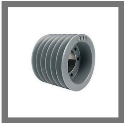
V Groove Pulley