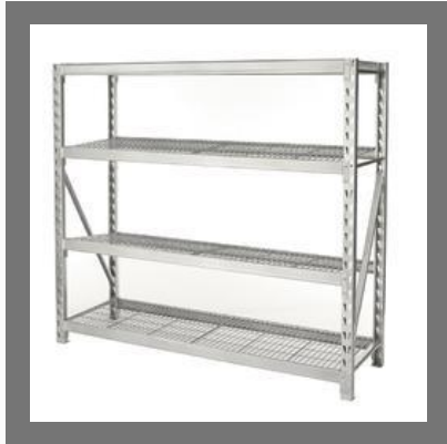
Stainless Steel Rack