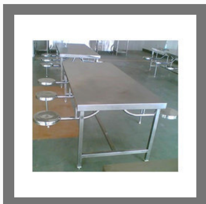
Canteen Dining Table