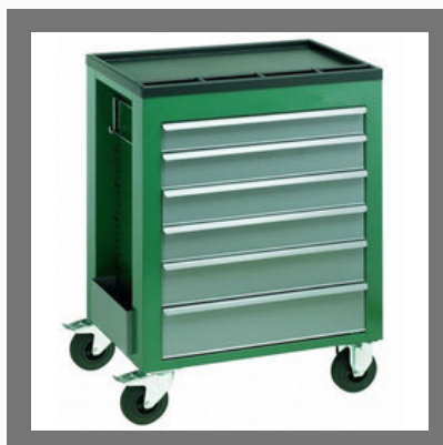
6 Drawer Tool Trolley