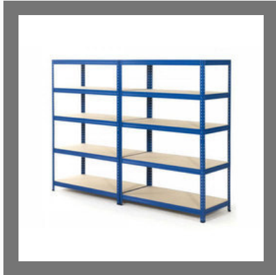
Slotted Angle Rack