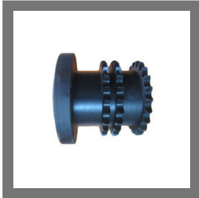
LR BLR Gear