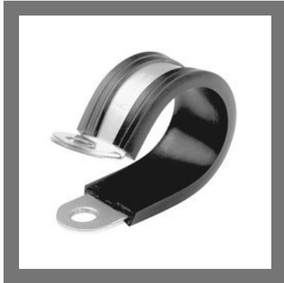
Rubber Beading Clamp