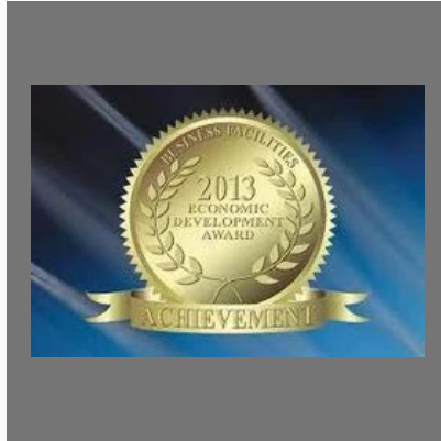
Facilities And Incentives For Developers Service