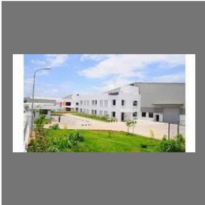
Indian Sez - Salient Features And Facilities Service