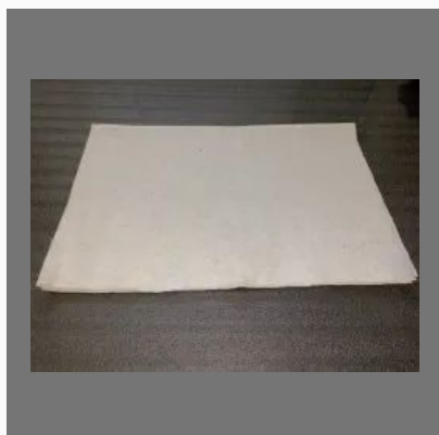
Recycled Non Woven Felt