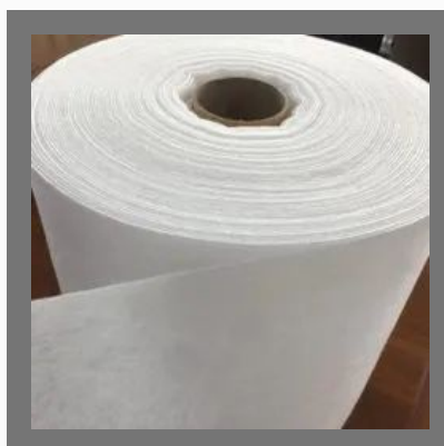
Hot Air Cotton For N95 Mask