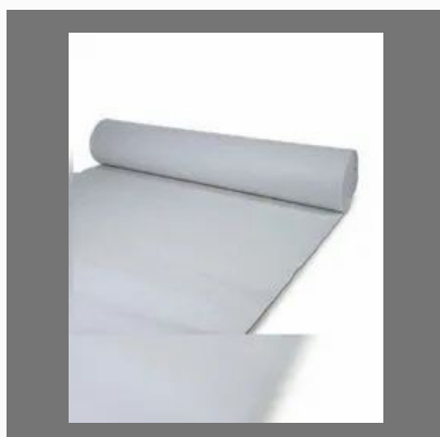
White Non Woven Geotextile Fabric