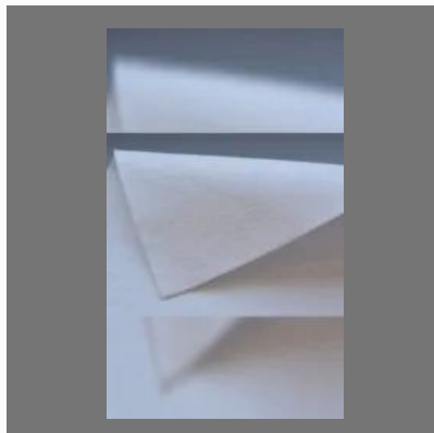
Plain Needle Punched Shoulder Pads Fabrics