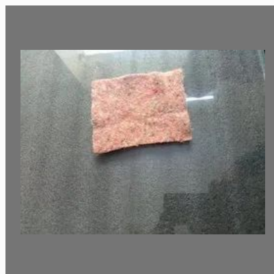
Non Woven Polyester Felt