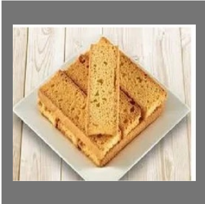
Baked Suji Rusk