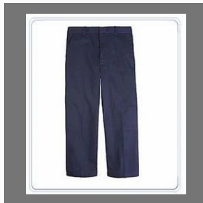
School Belted Trouser