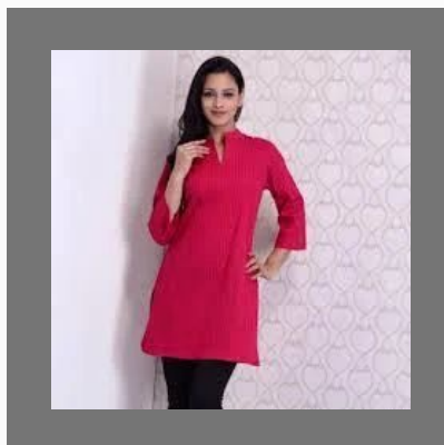
Plain Ladies Kurti