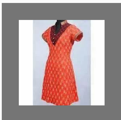
Printed Ladies Kurti