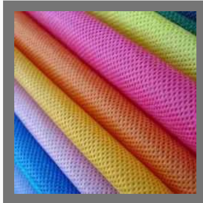
PP Non Woven Fabric