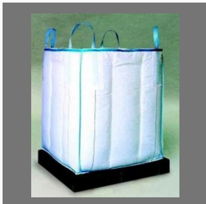
FIBC Full Top Open Bags