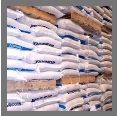
HDPE Woven Sack