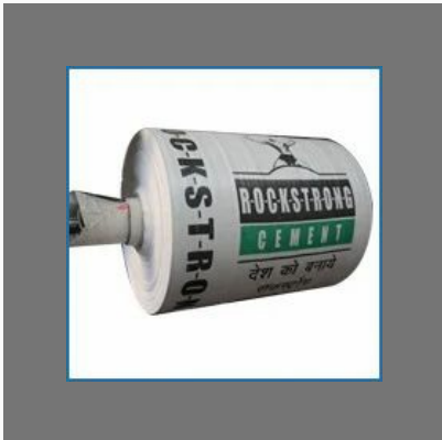
PP Woven Fabric