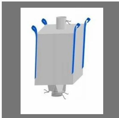
Spout FIBC Bags