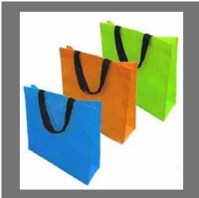
PP Non Woven Bag