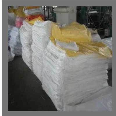
HDPE Non Woven Sack