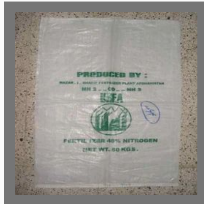
PP Woven Bag