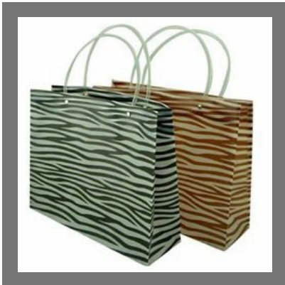
PP Shopping Bags