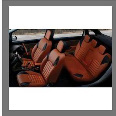
Innova Leather Seat Covers