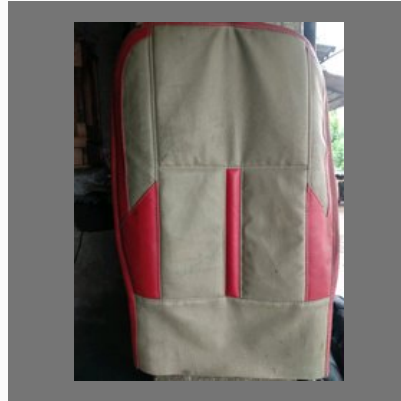
Fancy Seat Cover