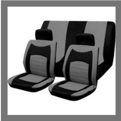
Car Seat Cover