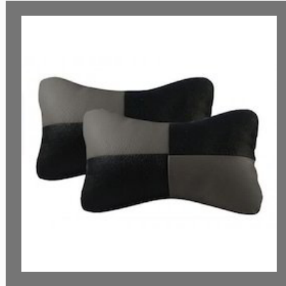
Neck Car Pillow