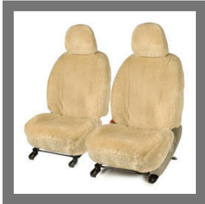
Sheepskin Seat Covers