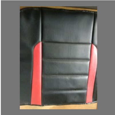
Black Seat Cover