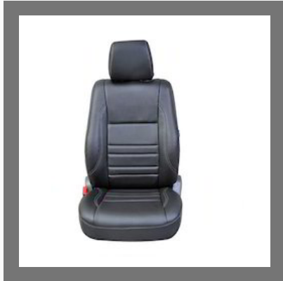
Leather Black Car Seat Cover