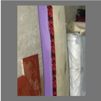
Seat Cover Fabric