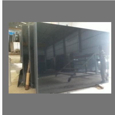
Cats Eye Grenight