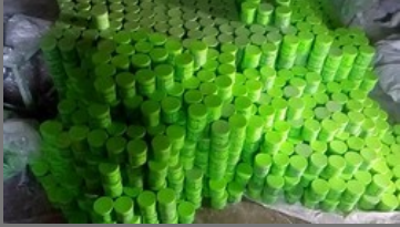
Pickling Lime Chuna