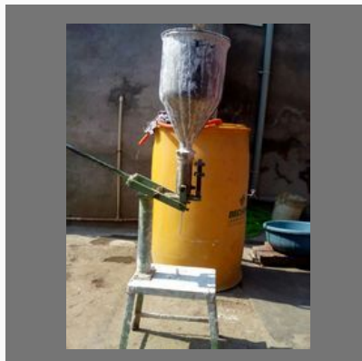
Chuna Tube Filing Machine