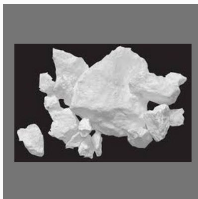
High Quality Quick Lime LUMPS