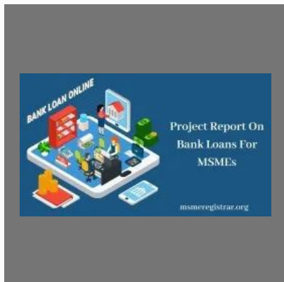
Project Report For Bank Loan