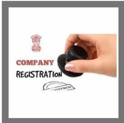
Private Limited Company Registration Service