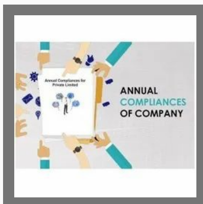
Annual Company Compliance Service