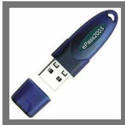
Digital Signature Services