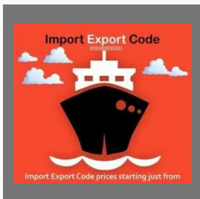
Import Export Code Registration