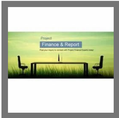
Project Finance Services