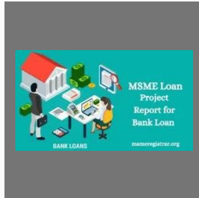
MSME Project Reports