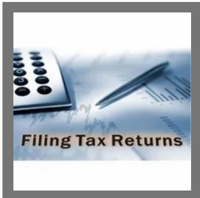
Income Tax Return Filing Service