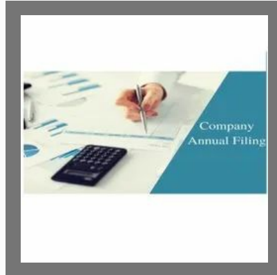
Company Annual Return Filing Service