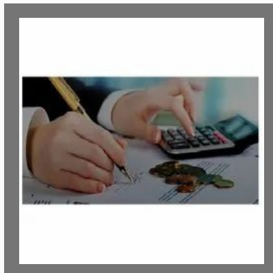
Chartered Accountant Services