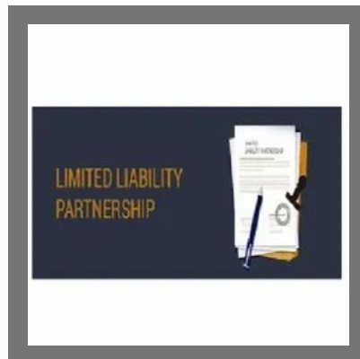
LLP Company Registration Service