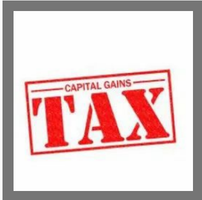
Capital Gains ITR Service