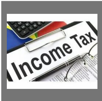
Income Tax Consultant