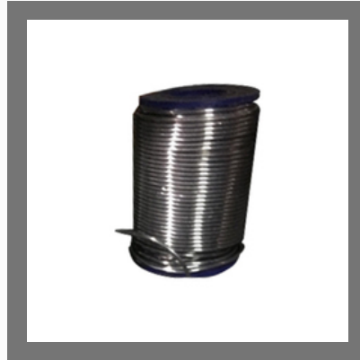
Zinc Cadmium Solder Wire