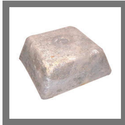
Antimony, Bismuth, Cadmium