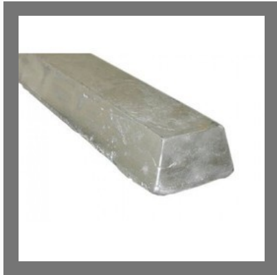
Low Melting Point Alloys