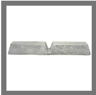
Tin Alloys, Lead Alloys , White Metal bearings. (babbits)