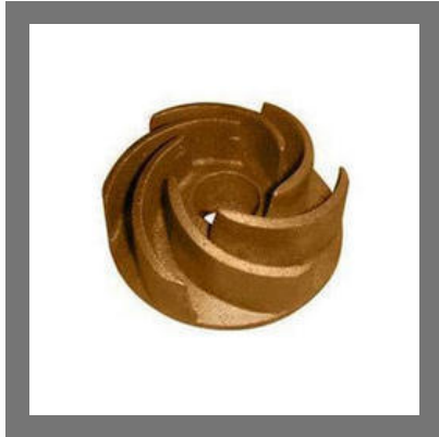
Beryllium Copper Ingots Castings