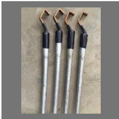
Lead tin Anode, Cathode, Chromium Electroplating Anodes