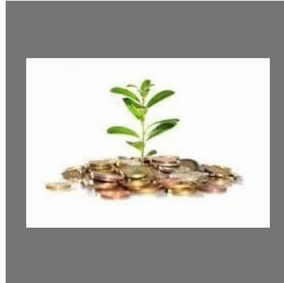
Working Capital Management