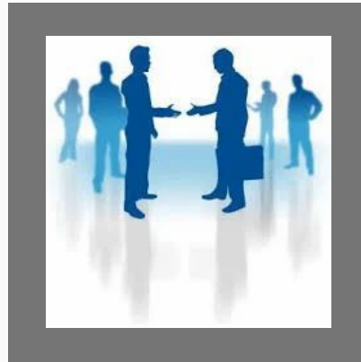
Strategizing The HR Function