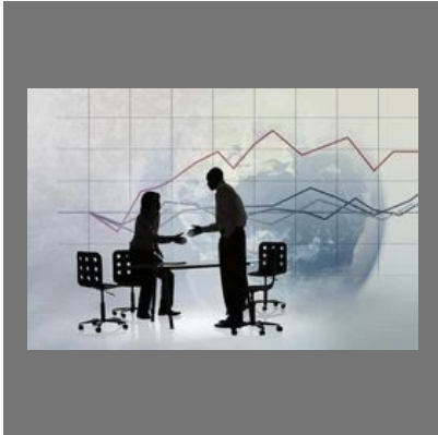
Strategic Cost Management