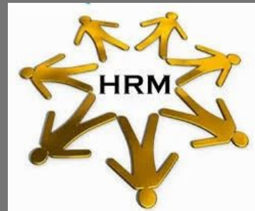
Human Resource Management