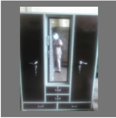
Double Door Steel Almirah