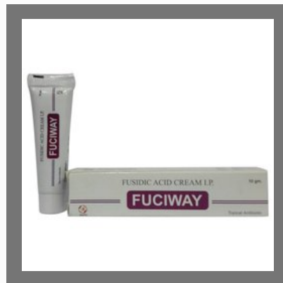
Fuciway Fusidic Acid