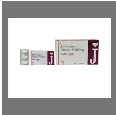
Hatch - 500