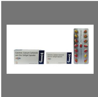
JECAL (Calcitriol Capsules)