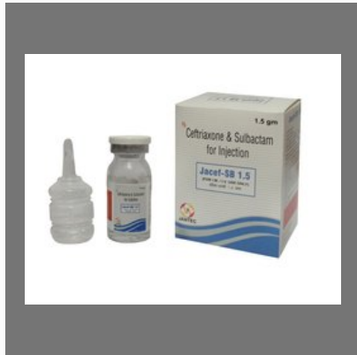
Jacef-SB 1.5 GM Injection