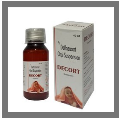
Deflazacort Decort Syrup