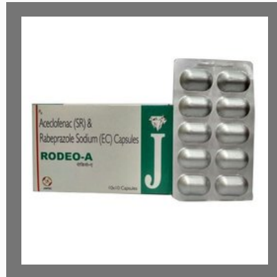
Rodeo-A 220 MG Capsules