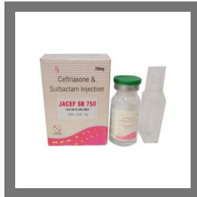
Jacef-SB 750 MG Injection