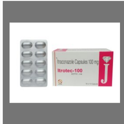
Itraconazole 100 MG Capsules