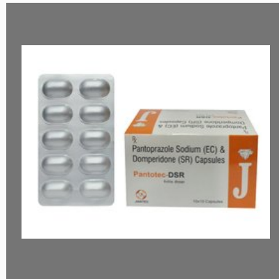
Pantoprazole 70 MG Capsules