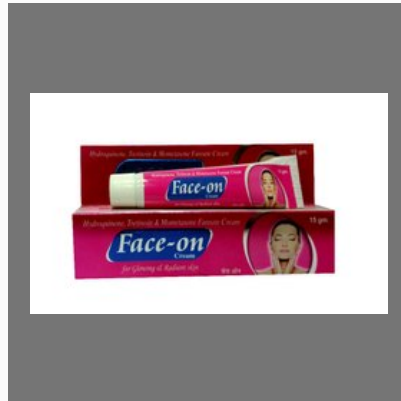
Face On Cream