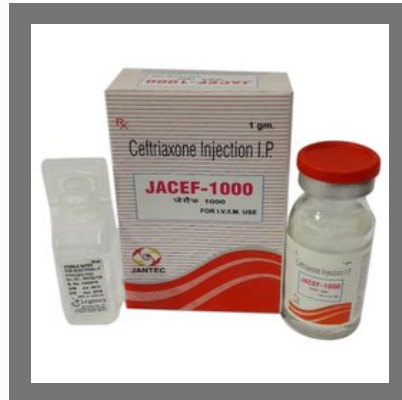
Jacef 1GM Injection