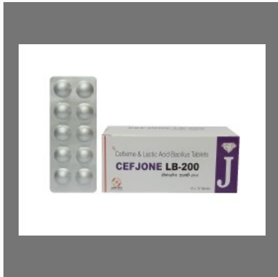
Cefjone LB -200