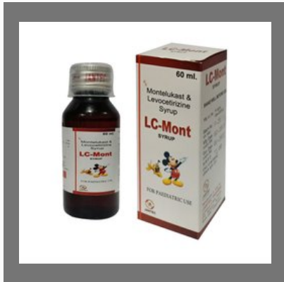
LC Mont Syrup