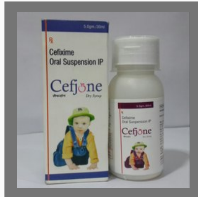
Cefjone Dry Syrup