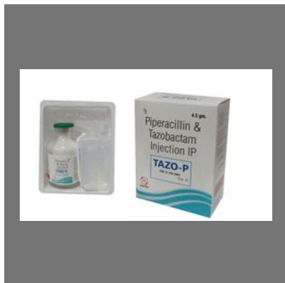
Tazo P Injection