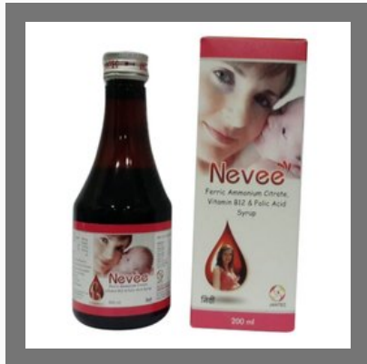
200 ML Nevee Syrup