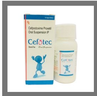
Cefpodoxime Proxetil Cefotec Dry Syrup