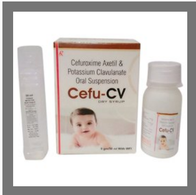
Cefu-CV Dry Syrup