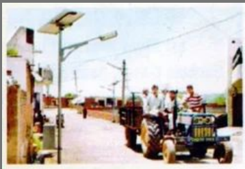
Solar Street Lighting System