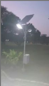
Protol Power Solar Street Light