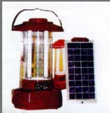
Portable Solar Lantern