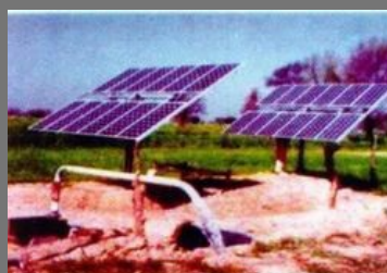
Solar Lighting Systems