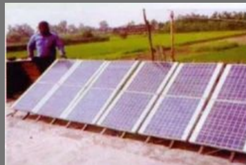
Solar Power Plant