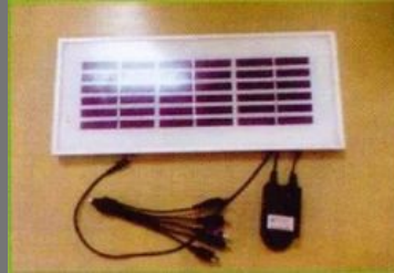
Solar Mobile Charger