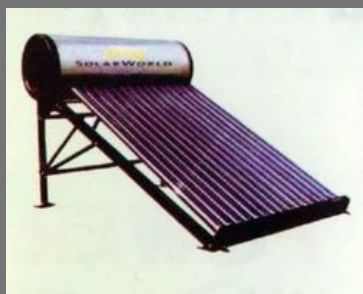
Solar Water Heater