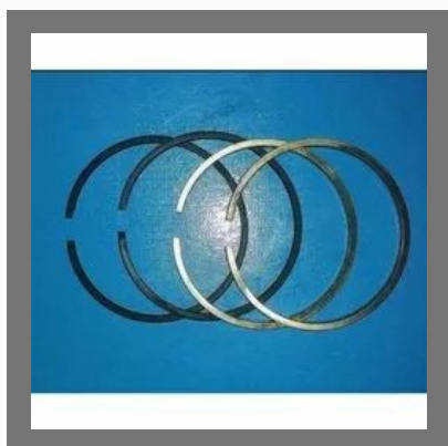
Piston Ring Set