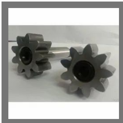
Oil Pump Gear Set