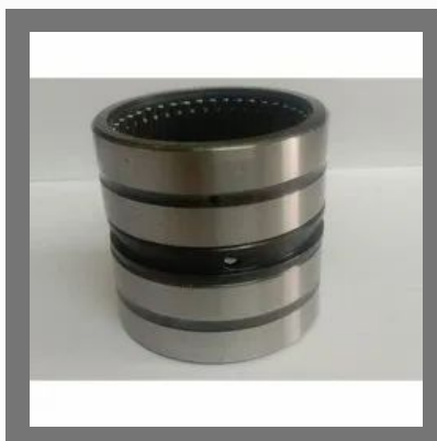
Needle Roller Bearing Set