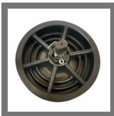
Discharge Valve Assemble