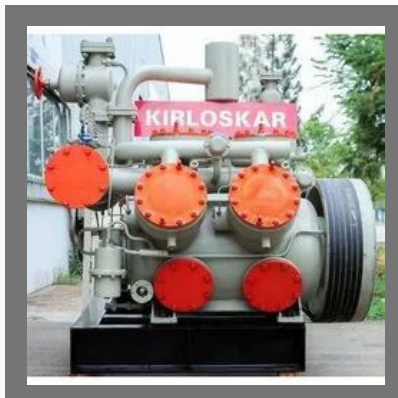
Kirloskar Ammonia Compressor