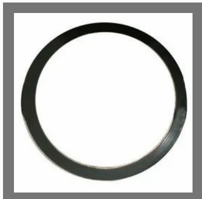
Round Valve Ring