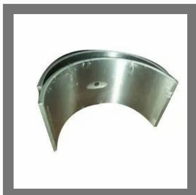
Connecting Rod Bearing