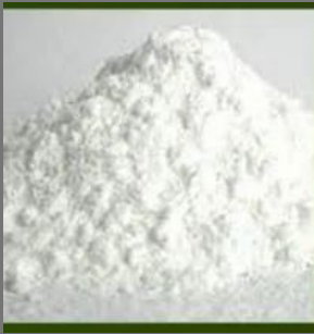
Corrugation Gum Powder