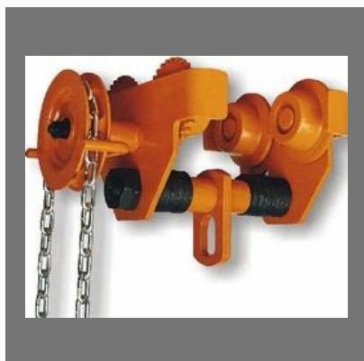
Manual Chain Hoists