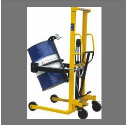
Drum Lifter Tilter