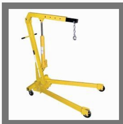
Shop Floor Cranes