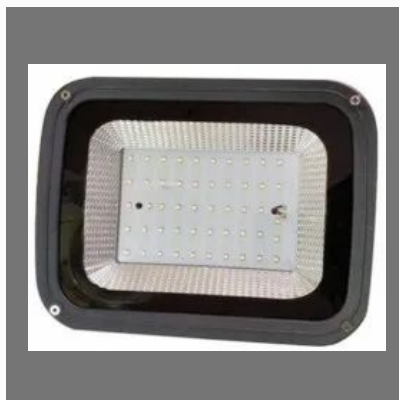
30W LED Flood Light