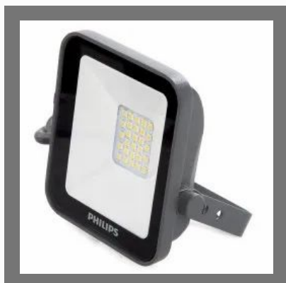
Philips LED Flood Light