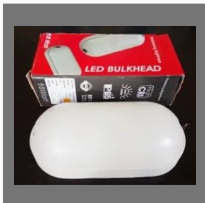
Led Bulkhead Lamp