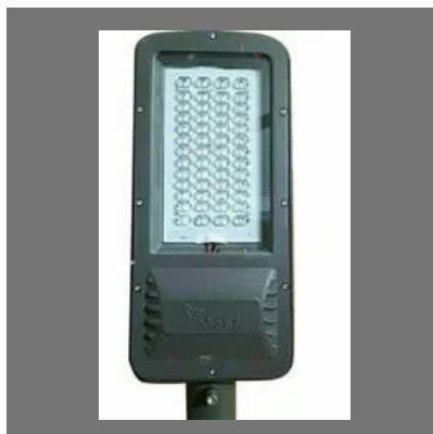
100W Syska LED Street Light