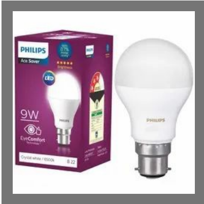
Philips Ace Saver LED Bulb