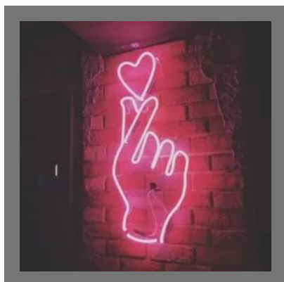
Neon Led Sign