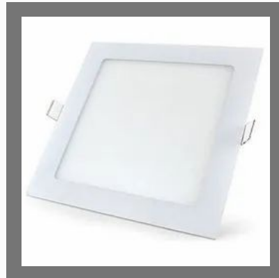
18W Square LED Panel Light