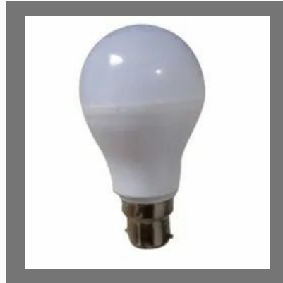
Rechargeable LED Bulb