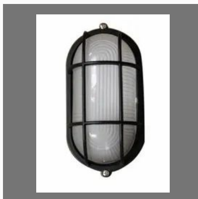
23W LED Bulkhead Light