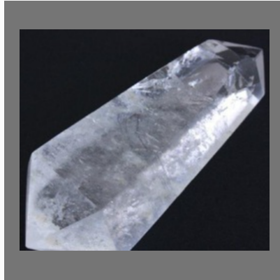
Natural Quartz Crystal