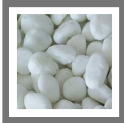
High Purity Quartz Lumps